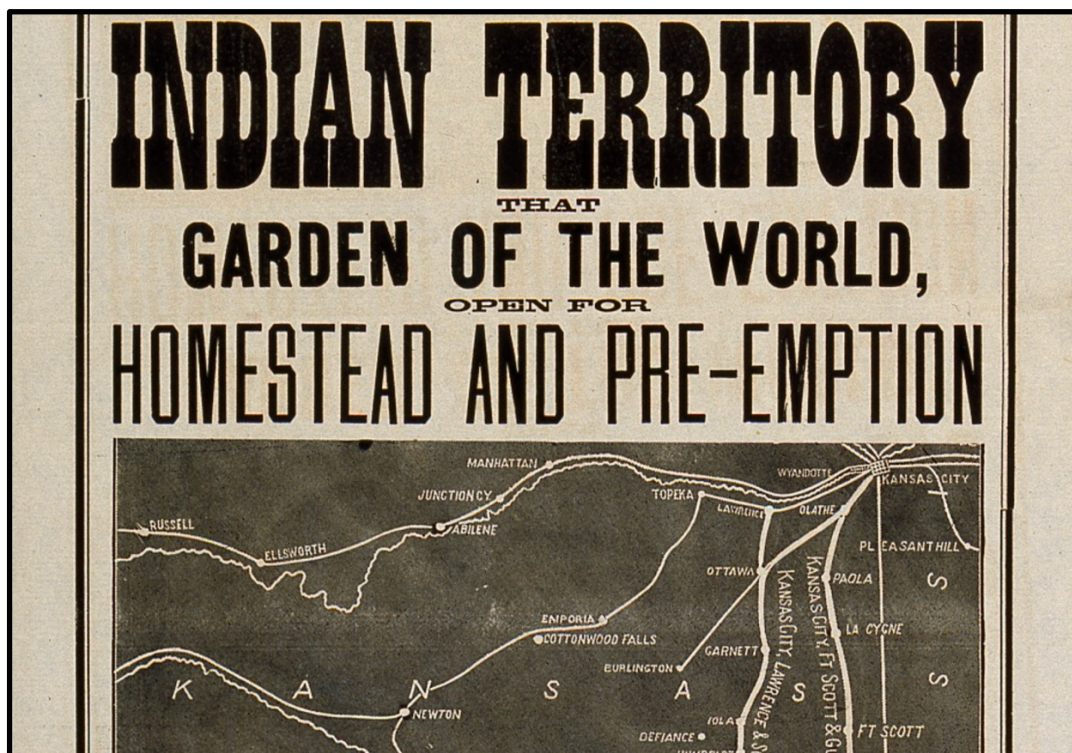
Figure 1. Poster advertising land in current-day Oklahoma. Records of US Army Continental Commands. Record Group 393. NAID 4662607. 1989[ca. 1880].

enabled homestead, preemption, and land title, that the US was able to legally extend its jurisdiction into these western Indigenous lands. It is because these lineages of land title exist, post “discovery” claims, that land-as-property maintains its value and place under US property law. In other words, this is a key aspect of how US colonialism is maintained. Figure 1 below is an 1889 poster run by Kansas City, Lawrence and Southern Railroad Co., advertising Indian Territory as a “garden of the world,” open for “homestead and pre-emption.” 2