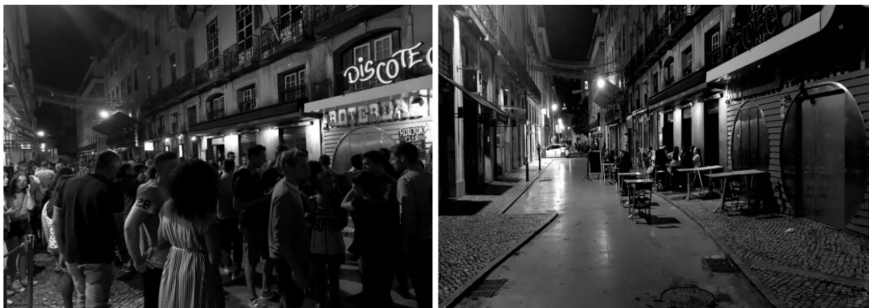
Figure 4. A comparison between nocturnal scenes before (September 2019) and during the COVID-19 pandemic (June 2020) on the world-famous Pink Street in the Cais do Sodré

As described in the previous section, tourists and Erasmus students enjoyed the pandemic Lisbon's nights drinking in the middle of the crowded streets of Bairro Alto and Cais do Sodré, while the police were punishing the youths of the working-class suburban neighborhoods of the city. In fact, the eagerness to reopen the city should come as no surprise. According to the Strategic Plan for Tourism in the Lisbon Region 2020-2014 , the nightlife is the primary reason to visit the city for a significant 18% of tourists and visitors (p. 112). Facing that, it is striking that clubs and discotheque were not allowed to re-open despite the city's opening to tourists and visitors during the pandemic summer of 2020. However, one of the reasons would have to do with the negative impacts derived from the expansion of tourism-oriented nighttime leisure economy over the past years that have undermined community livability and the coexistence between partygoers (most of them tourists and international students) and city residents (e.g., Nofre et al. 2017, 2019, 2020).