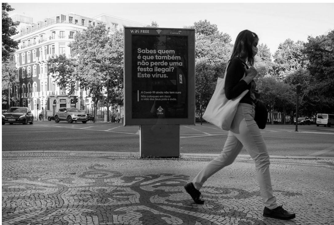
Figure 2. COVID-19 related street ad, by Lisbon City Council. June 2020. Source: Lisbon City Council, official Twitter account. Twit posted on: 26/06/2020.

Doubtlessly, such an enormous institutional effort to keep Lisbon as a COVID-free city demanded avoiding any potential threat that might jeopardize the recovery of urban tourism. For that very same reason, an extremely punitive institutional-civic front (Aramayona and Nofre 2021), with intense participation from television outlets and newspapers, emerged in the public opinion sphere by criminalizing the young people (especially from the suburbs working-class), accusing them of acting against the main national interest – i.e., not public health but the national economic recovery. Media started reporting how suburban working-class young people continued to drink on their ghetto streets and that police violence might, therefore, in some way be justified (e.g., Lusa 2020a, Rainho 2020). Also, as part of this punitive institutional-civic front , the Portuguese government reinforced the confinement of Lisbon working-class suburbs, including those located in its metropolitan area (Council of Ministers Resolution, No. 45-B / 2020, of June 22). Furthermore, article 5.B.6 of this resolution stated that, in the Metropolitan Area of Lisbon, the consumption of alcoholic beverages in public space was prohibited, with the exception of restaurant terraces. This meant that one of the most popular socialization practices in the working-class suburbs of Lisbon (drinking a beer on the street with friends) got prohibited.