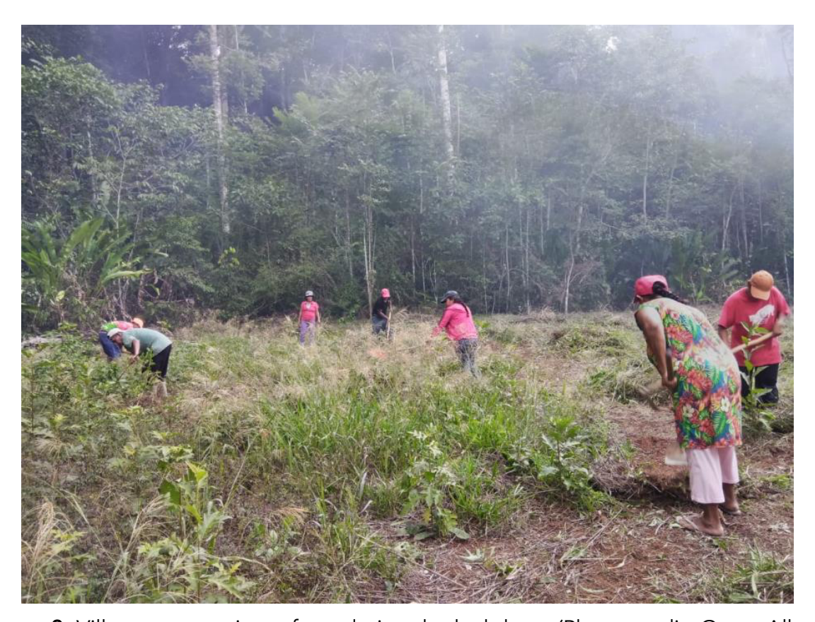
Figure 3. Villagers preparing a farm during the lockdown

We plant a lot of crops which we never plant. Main thing we used to plant was cassava, not only myself but also the other people. But today, people have 1 or 2 farms just like me, and we have banana, [sweet] potatoes, sugarcane and different crops we planted.