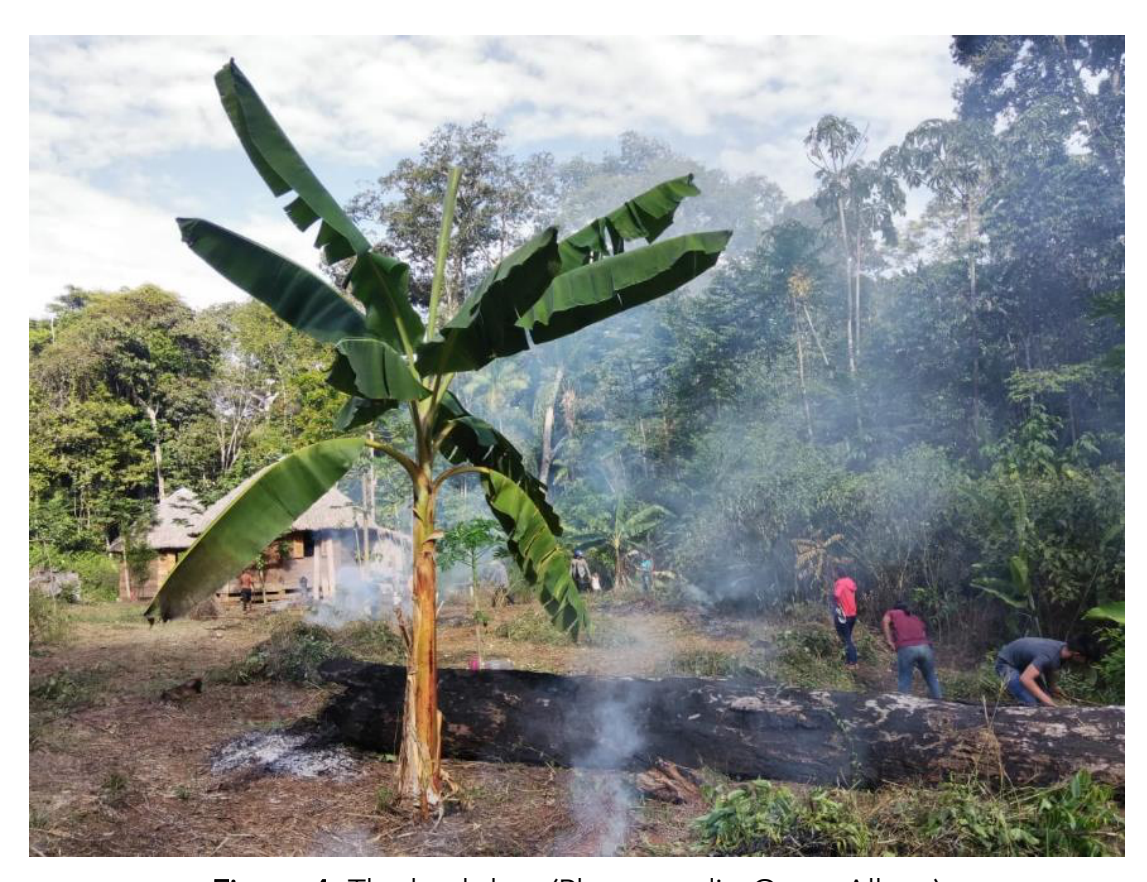
Figure 4. The backdam

of their vulnerability, particularly those situated close to or alongside the road such as Wowetta, Rupertee and Aranaputa. Communities reported that their own movement was restricted, and they could not see family members living in other villages and towns: "I have a daughter in Georgetown, but we can't go to Georgetown, we can't go anywhere, nobody wants to take the chance". However, some private sector activities, such as mining, were defined as 'essential services' and allowed to continue, and miners received special permission to continue to travel through the region to designated mining sites in the South Rupununi. There was fear that the restrictions on movement by communities, while allowing some miners for example, to travel would conceal potential illegal activities focused on resource extraction, while enabling the spread of the virus.