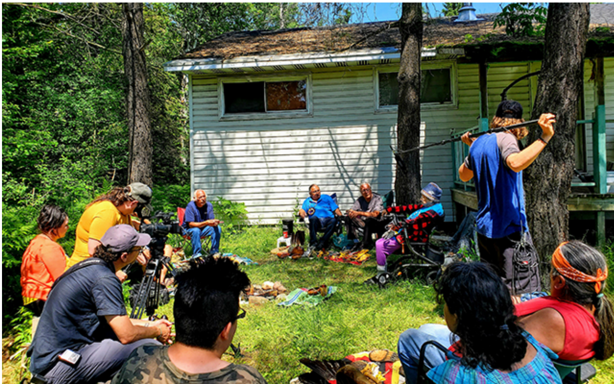
Image 5. Filming ceremonies

Like many Indigenous nations, we have a tremendous inherited responsibility to look after many jurisdictions. Beyond just fisheries, we also have forestry obligations, land obligations, minerals and resource obligations, water obligations and much more. We have so many things that have to be preserved.