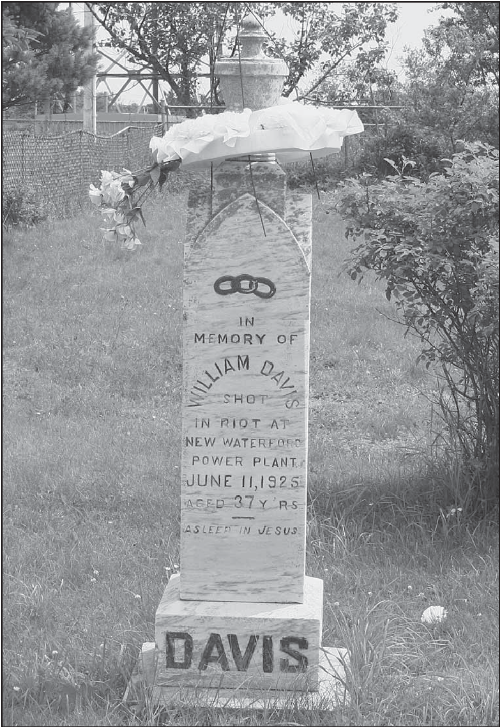
Figure 4: William Davis grave, Scotchtown.