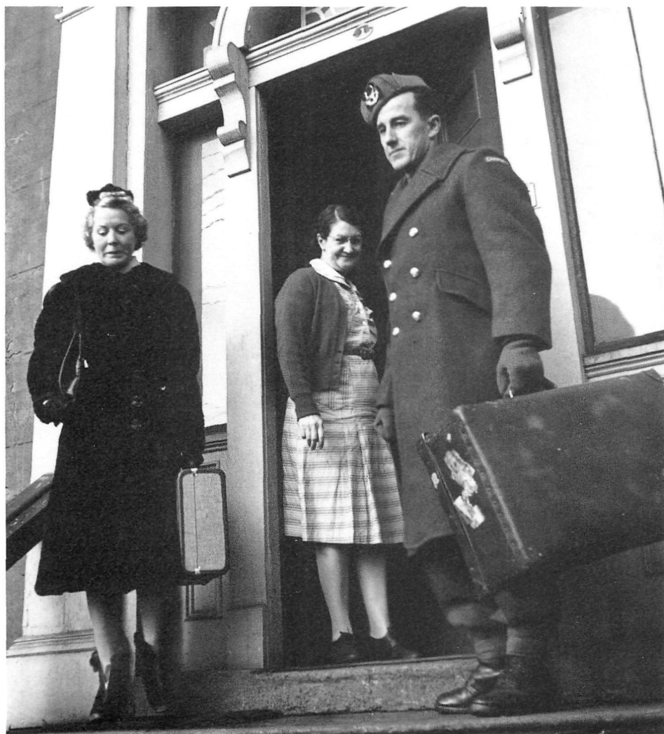
"No Vacancy". As part of a nationwide publicity campaign to dissuade people from moving to Halifax, the National Film Board produced newsreels that were shown in theatres across Canada in late 1943. This scene, staged by the NFB at the same time, was part of a series illustrating how difficult it was to find rental accommodations in Halifax.