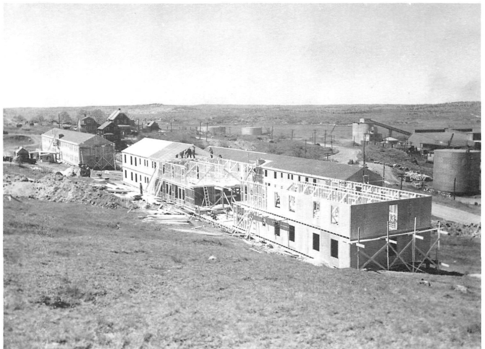
Wartime Housing Limited "Staff Houses" under construction in north end Halifax, 1941. Staff houses were barracks-like structures built to house single male workers. Although not intended to outlast the war, they served as "emergency shelter" housing well into the 1950s. Some were converted into apartments and used by Dalhousie University as married students' residences.

factor. But the Cousins survey shows that housing conditions varied so much across the peninsula that blanket generalizations are impossible. One conclusion which can be drawn is that widespread resentment, social tension and frustration occurred among those residents who could afford decent housing but could not get it, or those who were accustomed to cheap depression rents and house prices. It would be misleading to argue that everyone who came to Halifax during the Second World War was forced to live in substandard housing; nevertheless, the effects of fierce wartime demand for decent rental accommodation prevented many from securing the type of housing they felt