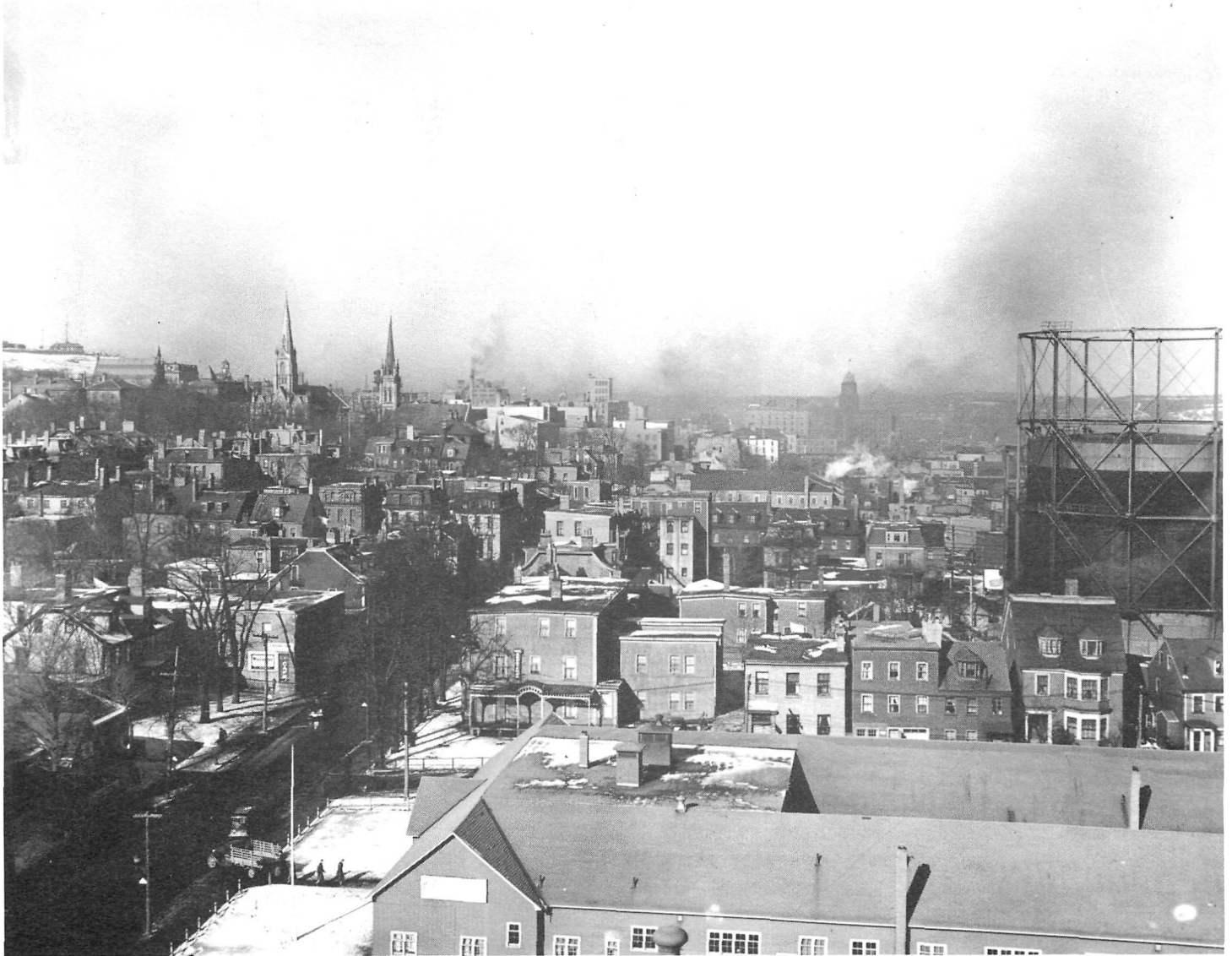
Hollis Street, looking north from the Nova Scotian Hotel, ca. 1942. Foreground: the Knights of Columbus Hut, one of a dozen canteens, clubs and hostels built or opened for transient service personnel during the war. Across the street stood the Salvation Army Red Shield War Service Centre, and next door the Grosvenor Hotel (centre foreground), a favorite with merchant seamen. The Navy League of Canada built a hostel for the Merchant Navy two blocks north of here; its long roofline is clearly visible near the centre of the picture.