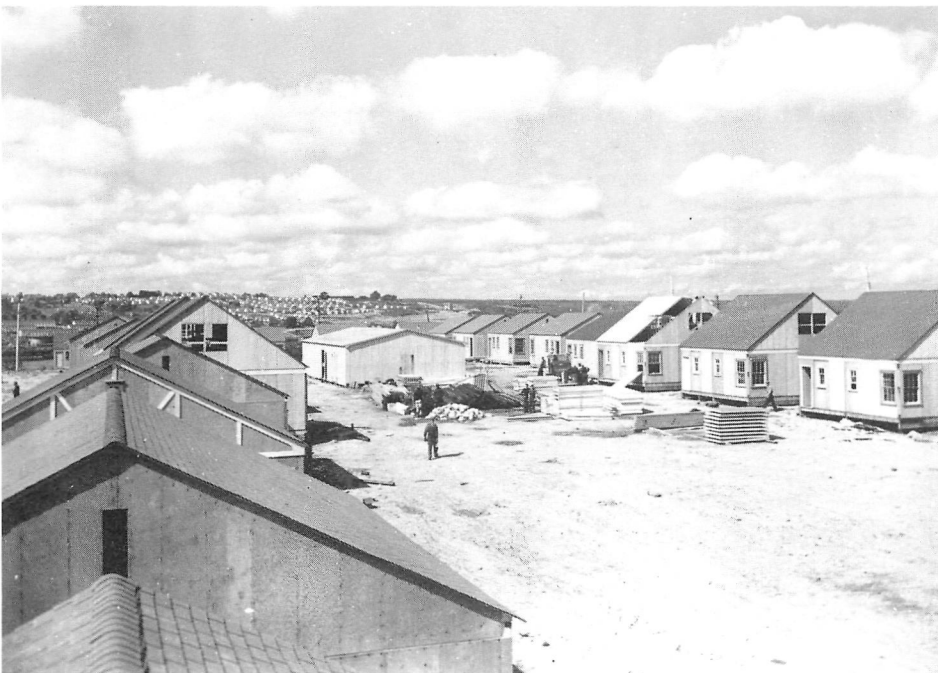
Wartime Housing Limited bungalows for war workers under construction in Dartmouth, ca. 1942. A similar project, the first in Canada, was built by WHL in the north end of Halifax in 1941, and is visible in the background of this photograph.

The rhythm of wartime life in Halifax was set by the military. Royal Canadian Navy shore establishments mushroomed from a peacetime complement of 500 to nearly 17,000 by 1945. 8 It was clear from the beginning of the wartime expansion programme that military authorities—particularly the Royal Canadian Navy—were unable to forecast their barrack requirements, thus beginning a lengthy series of ad hoc responses to meet accommodation emergencies as they arose. Of 1,400