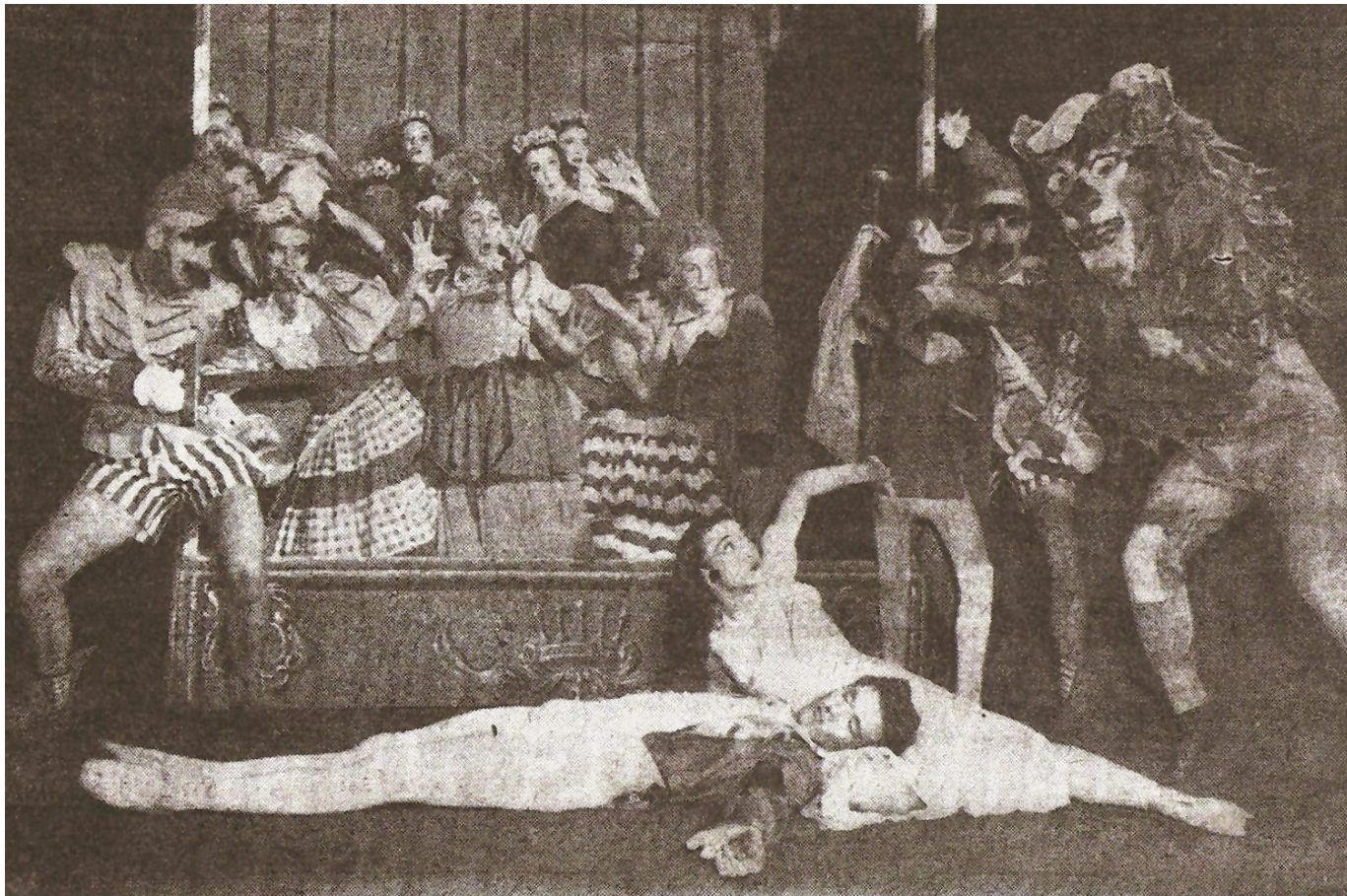
Figure 4: Still from Act 3 of The Rose and the Ring (“Ballet Fantasy” 1949, 13).

His theme for Princess Betsinda is nostalgic in character in which the strings achieve beautifully rich harmonic effects at various intervals during action in which she is chief participant—notably the pas de deux with Prince Giglio.