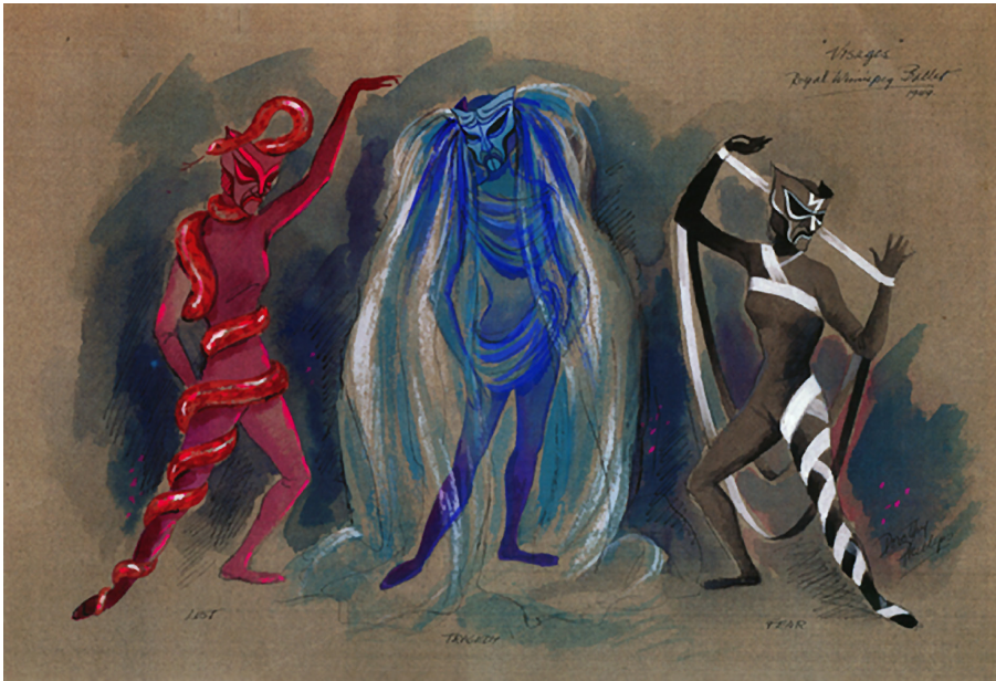
Figure 2: Sketch by Dorothy Phillips for Visages .

eleven-minute film was shot under the direction of Roger Blais. The excerpt from Visages is the longest of any single ballet on this film. It is 2 minutes and 19 seconds long (Blais 1949, 3:42 to 6:01). 8