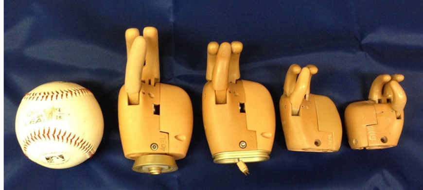
Figure 4: VASI electric elbow for children produced from 1984 to 1987.

undertaken in 1968. 39 Five different types of controls were used on these elbows, one of them being the UNB myoelectric controller. By late 1967 the OCCC had, on the basis of these fittings and testing, developed plans for production engineering, manufacturing, distribution and servicing. 40