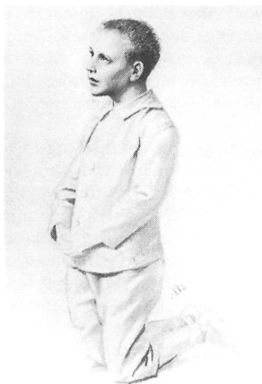
> BOURASSA, Napoléon «Jeune homme à genoux', 1890 Aquarelle sur papier 33 x 20,2 cm Collection: Musée du Québec

From the catalogue of an exhibition in the Galérie d'Art Lavalin, 1988. Under the guidance of Léo Rosshandler, Lavalin staff and the public were exposed to a wide range of traditional, modern, and avant-garde art by Québec and Canadian artists. Examples above courtesy of the Musée du Québec.