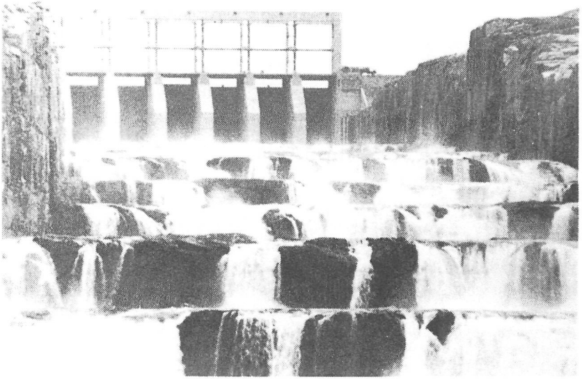
The spillway at La Grande 2 (LG2), major installation of James Bay project, phase 1.