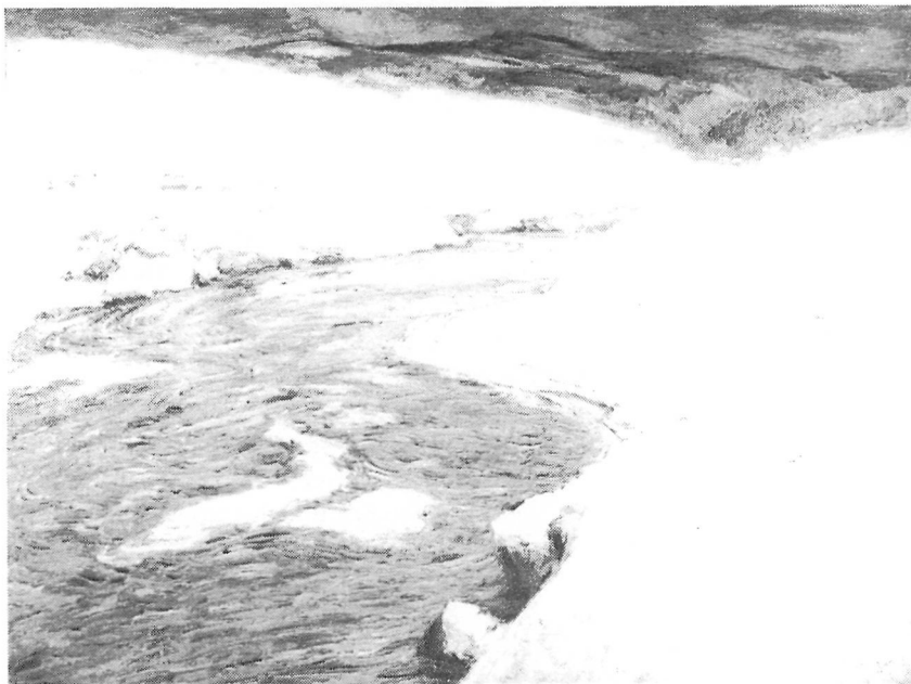
^ SUZOR-CÔTÉ Marc-Aurèle de Foy «le dégel de la rivière Nicolet» 1925 Huile sur toile 102,8 x 138,6 cm Collection: Musée du Québec