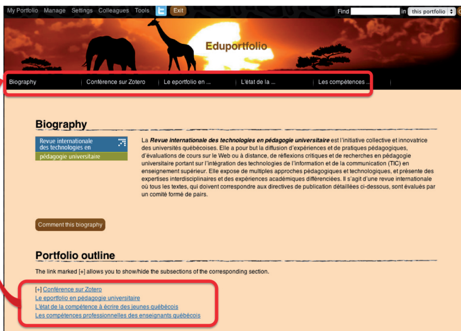
Figure 1: Page list at Eduportfolio

Eduportfolio offers yet another advantageous feature: downloading static versions of the portfolio. A static version requires a computer to be read and printed out, but does not require Internet access. This partly redresses the previously mentioned accessibility limitation, and provides a particularly useful option for “transporting” a portfolio.