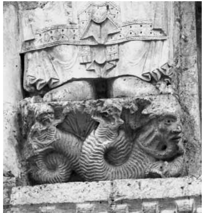
Figure 8. Serpent beneath monastic saint, Theophilus relief, abbey church of Sainte-Marie at Souillac (Photo: author, 2012).

To the angel who drops from the arch on the left, the monastic saint would appear to be reasonably centered and his occupation of the space defined by the arch would be modest. A different scene would reveal itself to the angel who crosses the arch on the right. Peter would appear to have moved to the extreme right of the space defined by the arch, the extent of his movement emphasized by the near-horizontal trajectory that the angel must take to reach him. Peter would have brought within his control, under his arch, the figure of his vassal, the metropolitan, and the cloistered church, the seat of the bishop. 65 As to the figure of the metropolitan, Blumenthal writes that "eventually, in the late eleventh century, the conferring of the pallium made the archbishop seem more like the pope's deputy with a delegated share in the universal primacy." 66 The cathedrals had been brought under the papal arch by the requirement that local bishops be subjected to the approval of the apostolic see or