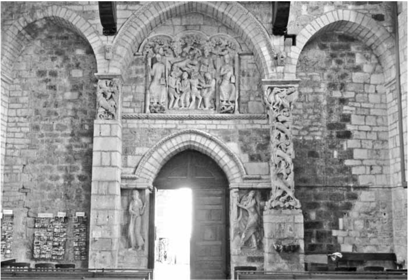
Figure 1. Inner-west wall of the nave of the abbey church of Sainte-Marie at Souillac (Photo: J. Bugslag, 2012).

it was most likely set originally within an old Carolingian tower porch over what was then the main entrance door to the nave. 10 The relief and the other sculptures now on the west wall of the nave are thought to have been moved into the nave in the course of seventeenth-century restorations to the west end of the church, during which the west wall of the nave is believed to have been constructed. Other than the fact that the relief was probably originally above eye-level, we cannot ascertain anything more definitive about the original setting of the relief that might assist in determining its meaning.