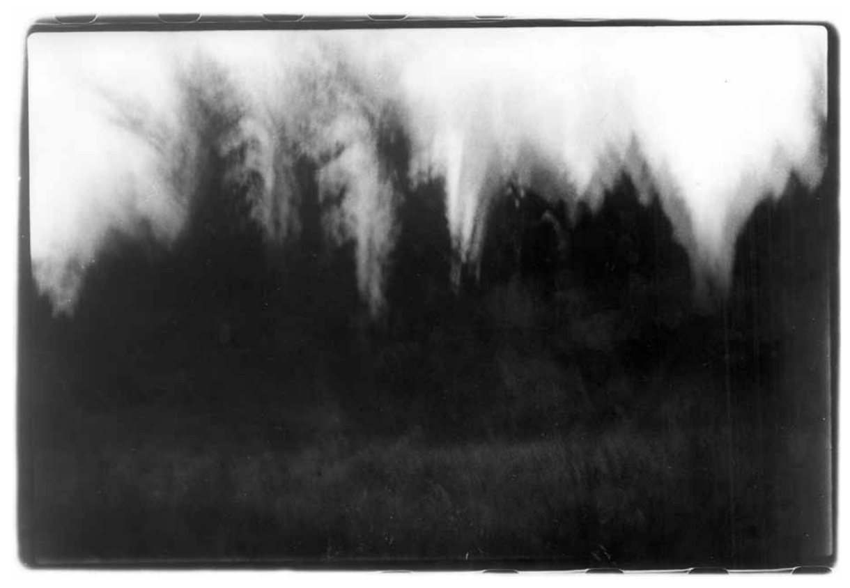
Figure 4. Alix Cléo Roubaud, Quinze minutes la nuit au rythme de la réspiration (Photo courtesy Jacques Roubaud and Éditions du Seuil).

aesthetic that only became fully formalized in art after her death. But, subtended to these bodily explorations, oscillating between subjective and objective views, was the presence of a chronic illness that profoundly limited her ability to work. At a symbolic level, air and breath would also seem to be a viable way of negotiating such boundaries, and indeed Roubaud's work is most profound when her struggle for air is literally mapped onto her struggle for self-expression in photography.