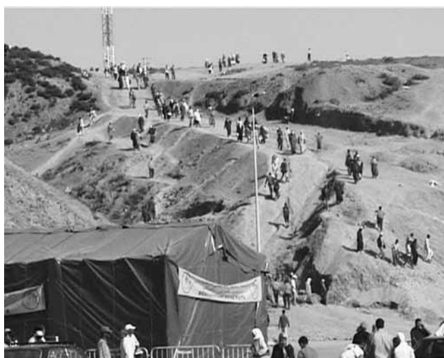
Figure 8. Ursula Biemann and Angela Sanders, Europlex , 2003. Video still, 20 min. (artwork © Ursula Biemann).

town of Tétuan, but work in the Spanish enclave of Ceuta, cross not only a border, but also a time zone (with a two-hour lag) each day. To convey the complex spatio-temporal dimensions that characterize the lives of these “permanent time travellers,” 59 the video employs advanced digital editing techniques that allow for a dense layering of video and audio tracks. The technical complexity of the work fulfils two functions: first, video’s non-linear, non-logical dimensions are exploited to emphasize what Mieke Bal calls “the anti-narrative thrust of heterochrony” in migrant culture. 60 But the video’s complexity—stacked moving and still images, running text, and elaborate soundtrack—also signals Biemann’s intention to underscore what she identifies as migrant women’s high-tech competence as dynamic participants in the cross-border micro-economies of Gibraltar. As she observes, “Many of them use the same state-of-the-art technologies of transportation and communication as high-tech businessmen do, in order to get to where they are.” 61