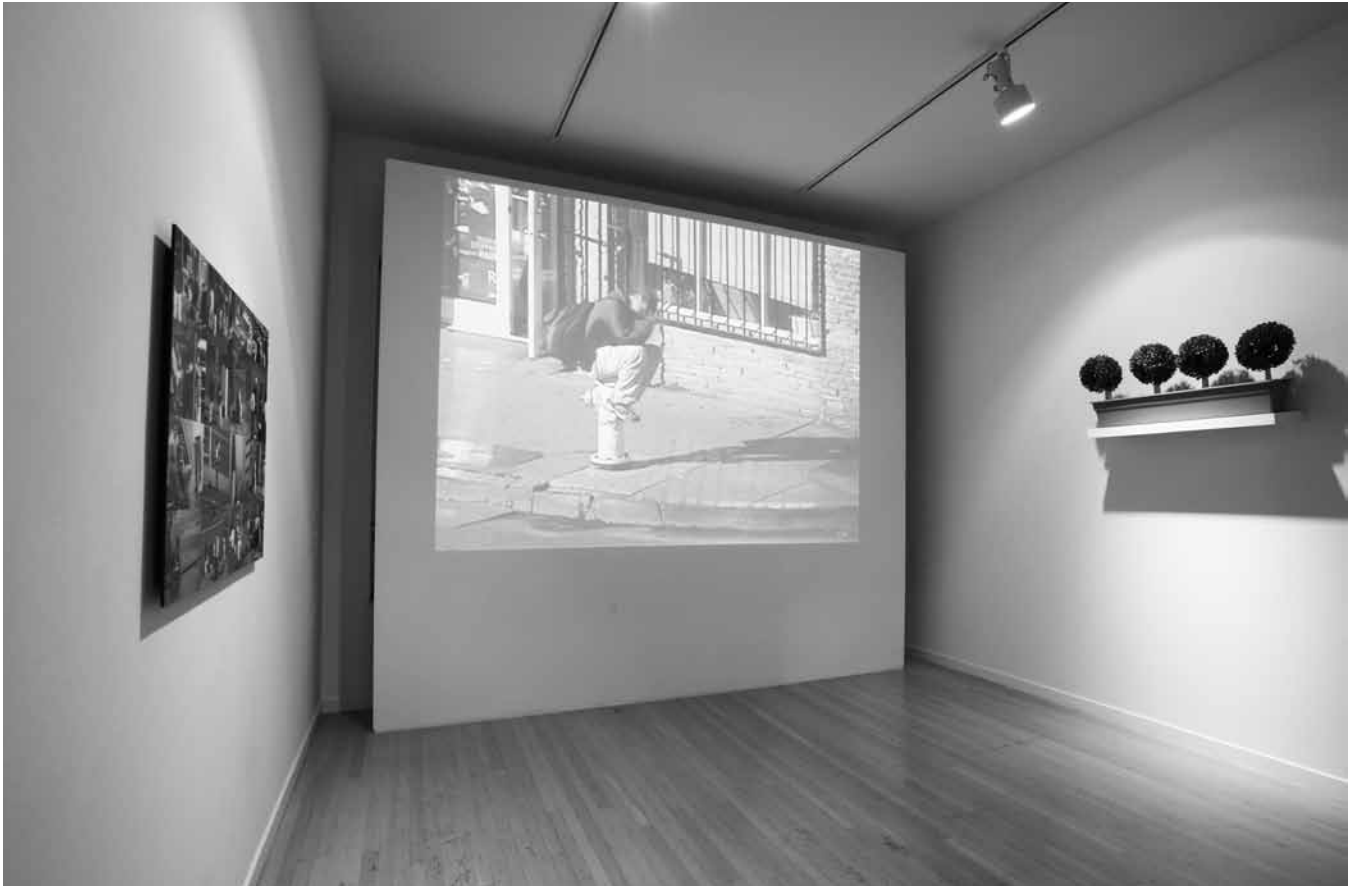
Figure 4. Tony Labat, Day Labor: Mapping the Outside (Fat Chance Bruce Nauman) , 2006. Surveillance station, 2-channel projection, LCD monitors, dimensions variable, installation detail (artwork © Tony Labat).

art from nowhere, for such an art, I contend, does not exist. Since art making is a material practice, there is no such thing as site-unspecific art. 37 With this observation, Bal acknowledges two important facets of contemporary art practice: first, that art today is inextricably linked to the logic of the global marketplace; second, that the globalization (and, in the context of this essay, the biennialization) of art cannot and should not obscure the geopolitical nuances of its production, distribution, and reception. To respond to this apparent stalemate, Bal proposes “migratory aesthetics” as a way to conceptualize the “aesthetic encounter [that] takes place in the space of, on the basis of, and on the interface with, the mobility of people as a given, as central, and as at the heart of what matters in the contemporary, that is, ‘globalized,’ world.” 38 In ways that resonate sharply with Bal’s observations, several artists represented at the 2006 Seville Biennial elaborated a reluctant position vis-à-vis the culture of biennials, posing subtle but significant challenges to the exhibition’s oblique self-narrative of post-national utopianism. What connects these artists—notably Cuban-American neo-