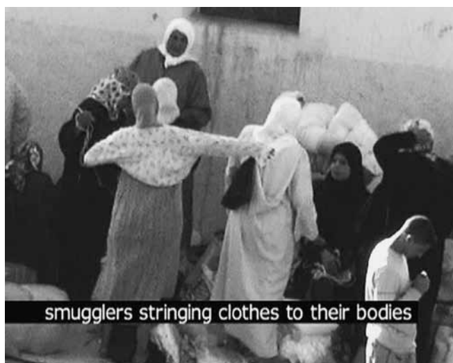
Figure 7. Ursula Biemann and Angela Sanders, Europlex , 2003. Video still, 20 min. (artwork © Ursula Biemann).