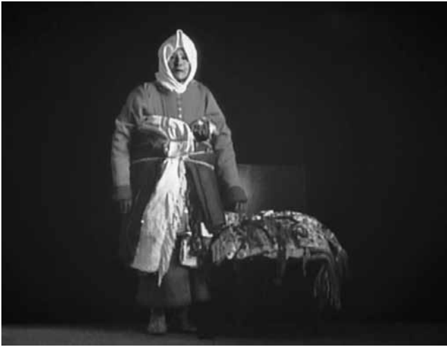
Figure 5. Yto Barrada, The Smuggler , Tangier, 2006. Video still, 11 min. (artwork © Yto Barrada).

gler's demeanour and facial expressions evince an unmistakably dignified desire to demonstrate the proper techniques for her trade. At another level, however, is revealed the mundane daily struggle of fashioning a living in the Gibraltar region; the woman's diminutive frame seems to groan with every layer added, and at one point a young girl appears from beyond the frame to assist with the wrapping.