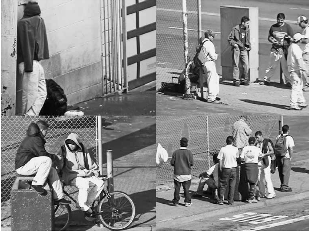
Figure 3. Tony Labat, Day Labor: Mapping the Outside (Fat Chance Bruce Nauman), 2006. Surveillance station, 2-channel projection, LCD monitors, dimensions variable, installation detail (artwork © Tony Labat).

that “the world is practically divided between curating cultures and curated cultures,” 35 still ring true.