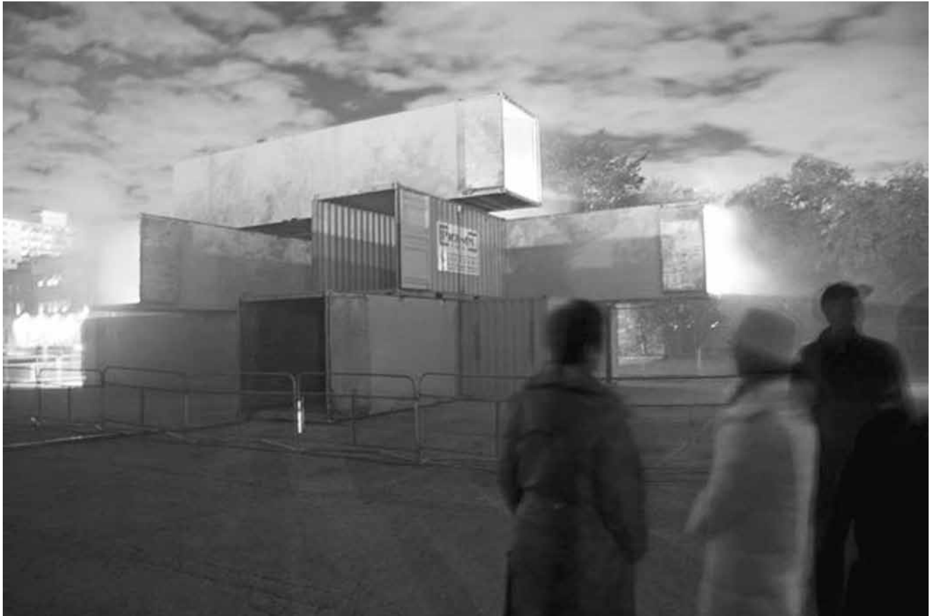
Figure 2. Brendan Fernandes, Future (... - - - ...) Perfect , 2008. Shipping containers, theatre lights, hazers (artwork © Brendan Fernandes).