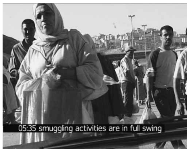
Figure 9. Ursula Biemann and Angela Sanders, Europlex , 2003. Video still, 20 min. (artwork © Ursula Biemann).

We prefer to think of buildings as solid, of home as a place of safety, of ourselves as separate from our neighbours, and of our bodies as made of living flesh not inorganic atoms. A traumatic event demonstrates how untenable, or how insecure, these distinctions and these assumptions are. It calls for nothing more or less than the recognition of the radical relationality of existence. 66