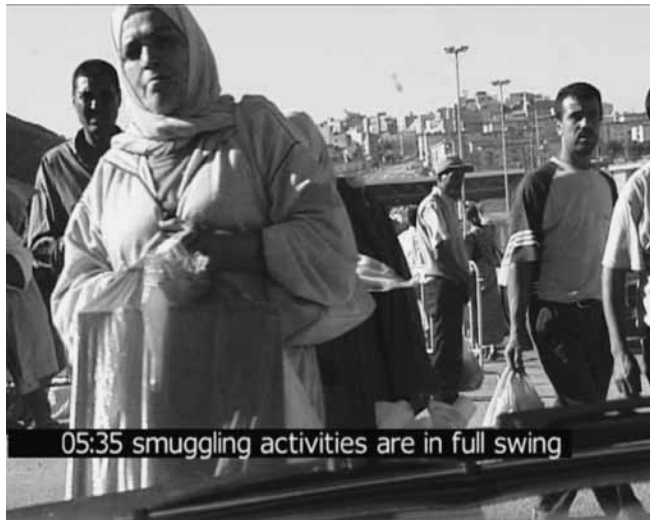
Figure 9. Ursula Biemann and Angela Sanders, Europlex , 2003. Video still, 20 min. (artwork © Ursula Biemann).

We prefer to think of buildings as solid, of home as a place of safety, of ourselves as separate from our neighbours, and of our bodies as made of living flesh not inorganic atoms. A traumatic event demonstrates how untenable, or how insecure, these distinctions and these assumptions are. It calls for nothing more or less than the recognition of the radical relationality of existence. 66