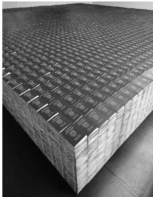
Figure 1. Alfredo Jaar, One Million Finnish Passports , 1995. One million replicated Finnish passports, glass, 800 x 800 x 80 cm, installation view, Museum of Contemporary Art, Helsinki (artwork © Alfredo Jaar).

The "theoretical transmigration" 18 so thoroughly endorsed by the nomadic culture of perennial international exhibitions smacks of a romanticism that is uncannily familiar. Indeed, it would appear that biennial culture has supplied contemporary art with a convenient replacement for hackneyed, now largely discredited myths of the artist-sage, artist-madman, and artist-melancholic: artists who ride the biennial circuit are once again "poets unhoused and wanderers across language." 19 But whereas