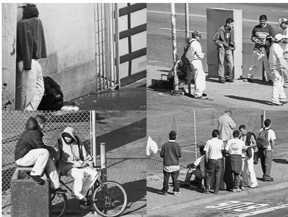
Figure 3. Tony Labat, Day Labor: Mapping the Outside (Fat Chance Bruce Nauman), 2006. Surveillance station, 2-channel projection, LCD monitors, dimensions variable, installation detail (artwork © Tony Labat).

that “the world is practically divided between curating cultures and curated cultures,” 35 still ring true.