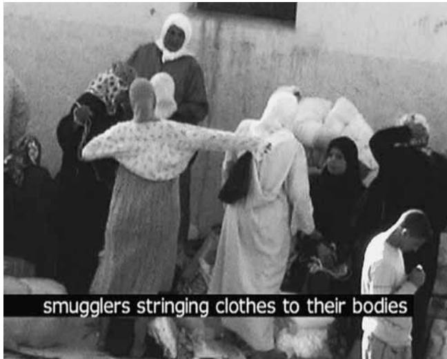
Figure 7. Ursula Biemann and Angela Sanders, Europlex , 2003. Video still, 20 min. (artwork © Ursula Biemann).