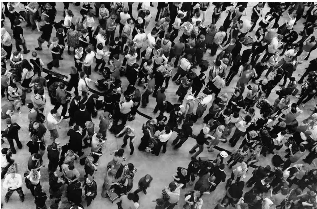
Figure 10. Dean Ayres, Dancing on the Edge , 2007.