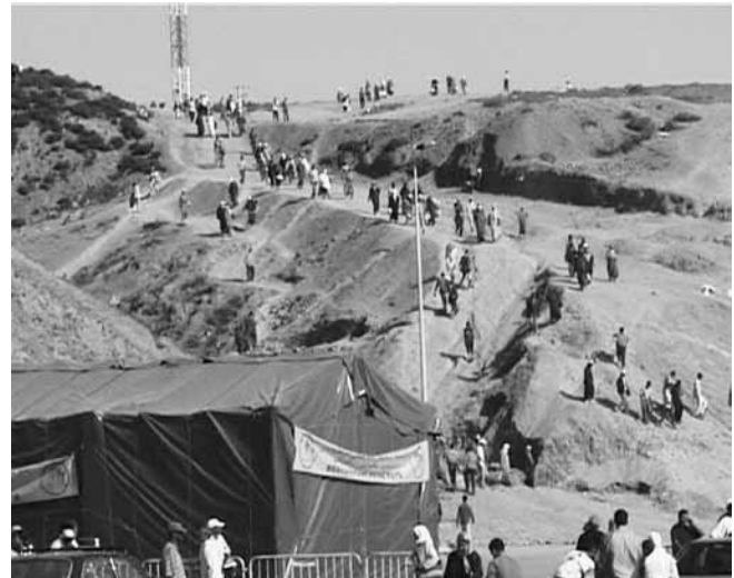
Figure 8. Ursula Biemann and Angela Sanders, Europlex , 2003. Video still, 20 min. (artwork © Ursula Biemann).

town of Tétuan, but work in the Spanish enclave of Ceuta, cross not only a border, but also a time zone (with a two-hour lag) each day. To convey the complex spatio-temporal dimensions that characterize the lives of these “permanent time travellers,” 59 the video employs advanced digital editing techniques that allow for a dense layering of video and audio tracks. The technical complexity of the work fulfils two functions: first, video’s non-linear, non-logical dimensions are exploited to emphasize what Mieke Bal calls “the anti-narrative thrust of heterochrony” in migrant culture. 60 But the video’s complexity—stacked moving and still images, running text, and elaborate soundtrack—also signals Biemann’s intention to underscore what she identifies as migrant women’s high-tech competence as dynamic participants in the cross-border micro-economies of Gibraltar. As she observes, “Many of them use the same state-of-the-art technologies of transportation and communication as high-tech businessmen do, in order to get to where they are.” 61