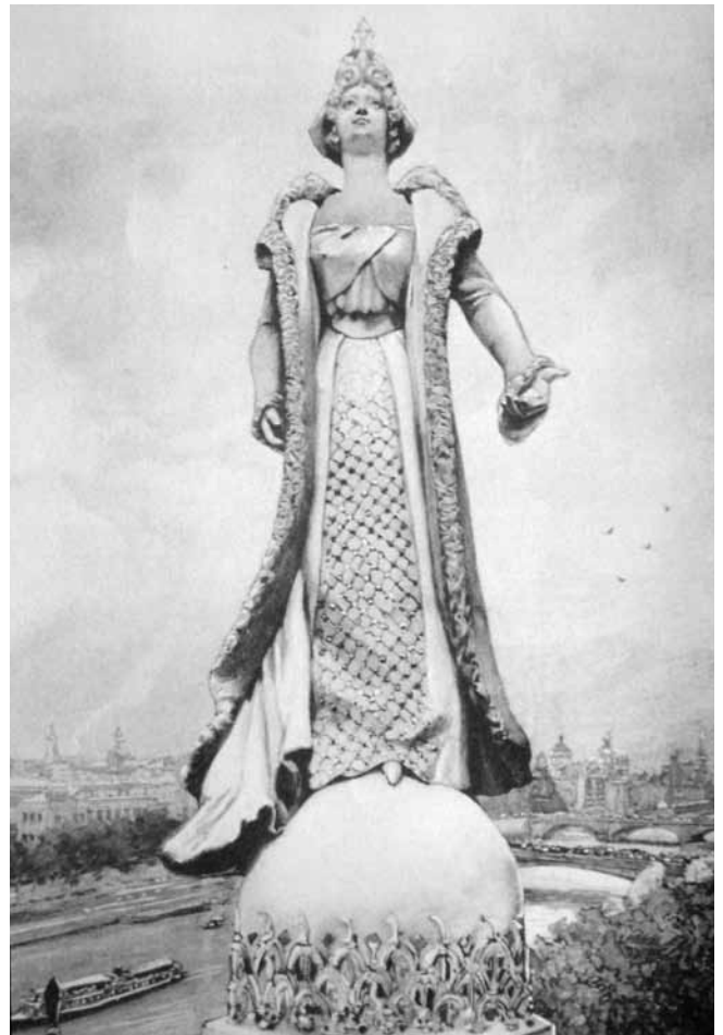
Figure 2. La Parisienne , cover of L'Illustration , 14 April 1900.

The general shape and appearance of the gateway was evidently inspired by Binet’s use of and interest in the theories of German botanist Ernst Haeckel. Haeckel promoted Darwinian evolutionary biology, 22 which the French usually called transformism , using the term associated with the French precursor to Darwin, Jean-Baptiste Lamarck. As one account of the gate explained, Binet “has observed the laws of transformism and has noted how, with the lower beings, the natural kingdoms converge and intermingle; finally, and most important of all, he has met Haeckel ( Kunstformen de Natur ) and discovered what an