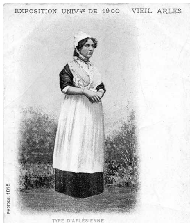
Figure 8. Postcard, Exposition Univ<sup>e</sup> de 1900 Vieil Arles: Type d'Arlésienne . Collection of the author. Image by Jarrett Duncan.

lated what life must have been like in the past, when the medieval buildings were new, the Arles reconstruction elided the differences between then and now.