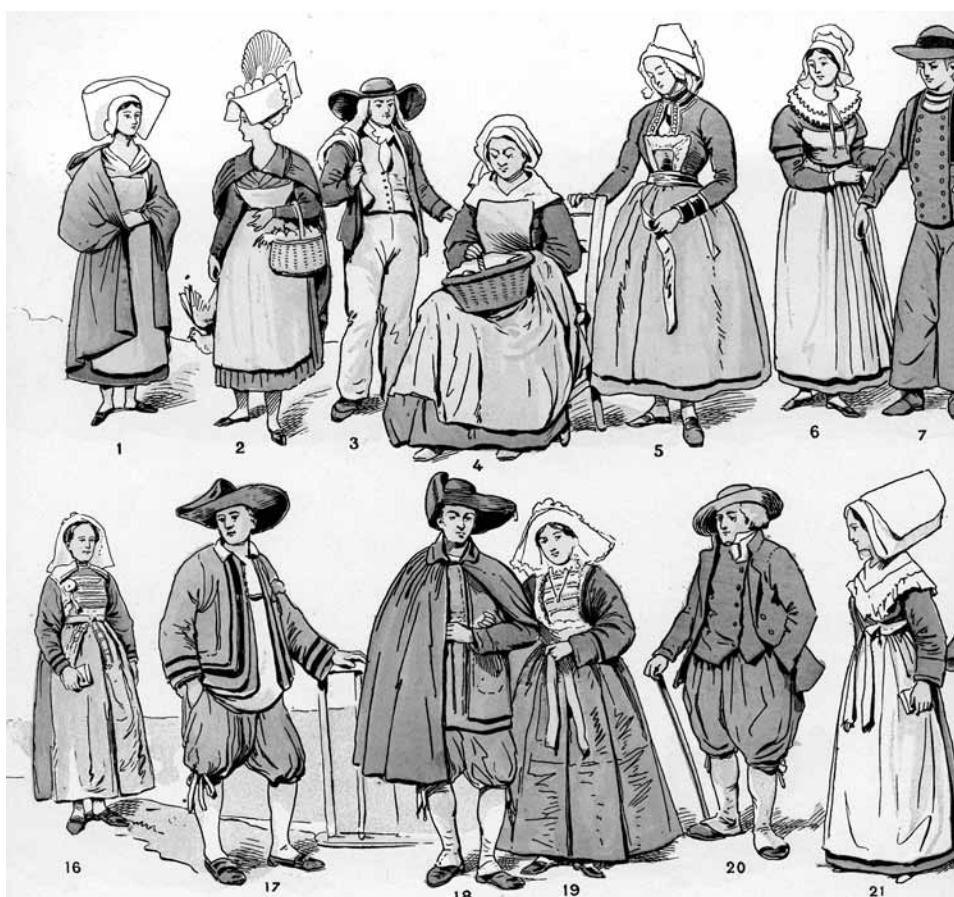
Figure 10. François Courboin, Musée Centennial des Costumes Français . Detail of illustration in L'Exposition de Paris (1900) , vol. 3 (Paris, 1900), supplement no. 33, following p. 260.

to nature and equating them all with peasants. There are no flâneurs in the provincial backgrounds. Both official exhibitions and popular illustrations depicted all provincials as peasants living in an unchanging world, thereby transforming provincial clothing into folk costume. The Arlésienne , that quintessential woman of Provence, thus carried the symbolic weight of a supposedly unchanging and unchangeable tradition. 74 Provincial women stood in stark contrast to the Parisienne in the clothing displays, revealing and reinforcing a boundary that was also demarcated in the exposition's art exhibits.