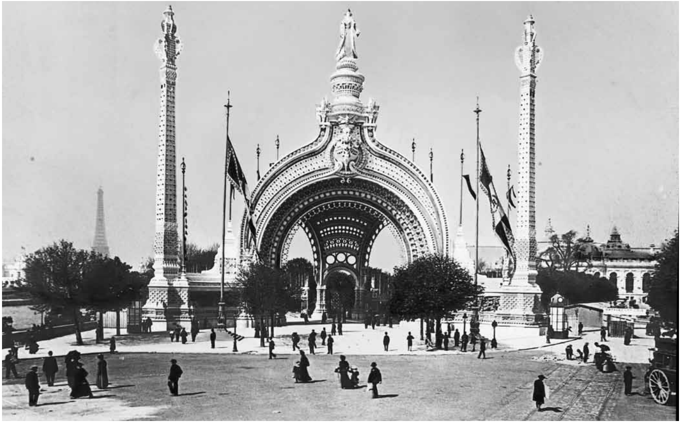
Figure 1. Joseph Hawkes, Paris Exposition: main entrance gate, Paris, France, 1900 . Lantern slide, 8.26 x 10.16 cm.

for debates over decentralization and the role of “les provinces” in the nation. 8 Decentralization has sometimes been viewed as a purely right-wing political ideology, but in the 1890s, along with regionalism, it crossed political boundaries and was fundamentally concerned with how the nation outside the Île-de-France might define itself. In 1895, Parliament appointed a Commission décentralisatrice to study how decentralization might be implemented; La Revue socialiste claimed that “decentralization is the order of the day”; and naturalist writer Jean Ajalbert called it the year’s favourite “tarte à la crème politico-littéraire.” 9