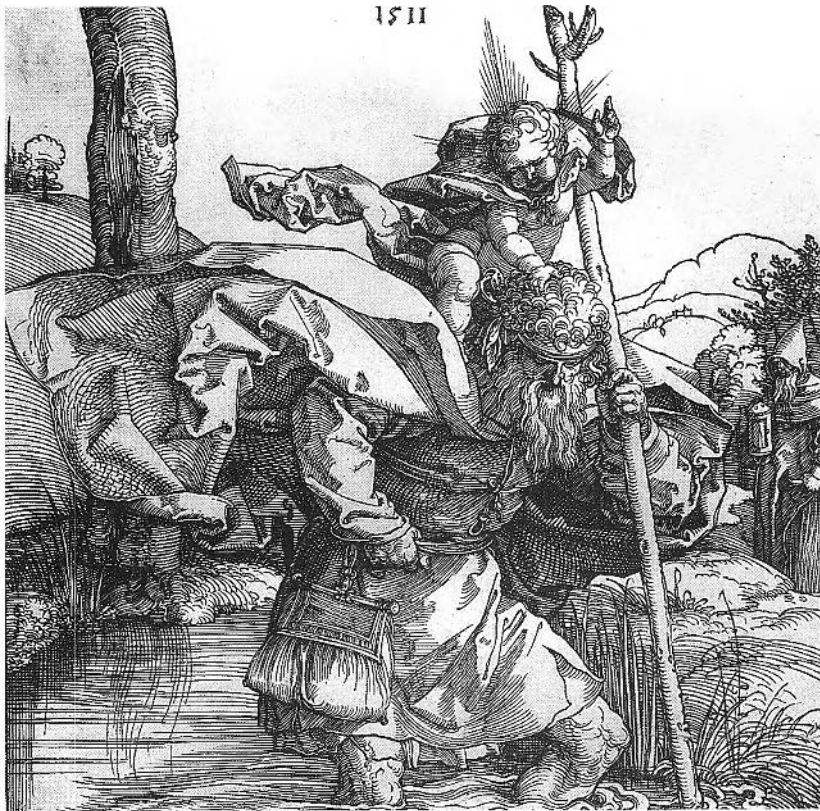
Figure 2. Albrecht Dürer, St Christopher , 1511. Woodcut, 21 x 21 cm. The British Museum.

linked to the ideal atemporal character of devotional imagery—the definition is Jameson’s— 7 through a dialectic between the narrative historical aspect of Christopher’s action and an implicit allegory of charity presented for contemplation. The contemplative provision merges with magical belief in apotropaic powers attributed to the sight of St Christopher’s image.