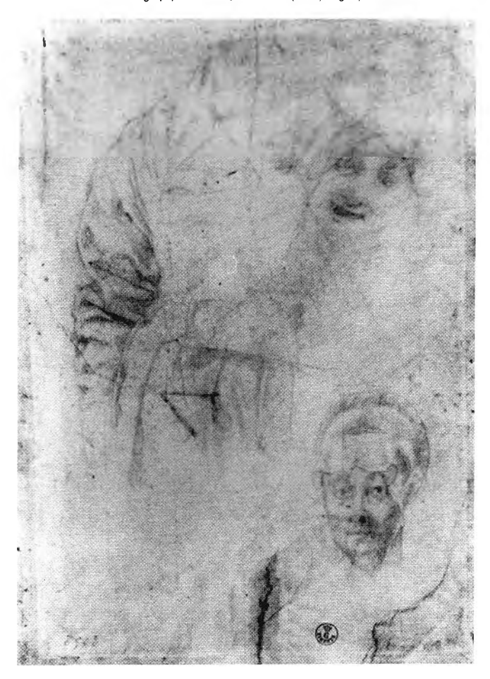
Figure 5. Pontormo (Jacopo Carucci), Maria Salviati, ca. 1543. Drawing, red chalk, 26.5 x 18.8 cm. Florence, Uffizi, Gabinetto Dis. e St. no. 6503F (Photo: from Edward S. King, "An Addition to Medici Iconography," Walters Journal, III (1940), Fig. 7).

by a retrospective ducal commission, about 1537-43,<sup>37</sup> it seems illogical that the propagandistic Duke would have had himself portrayed in childhood as sheltered, poorly dressed or anxious.