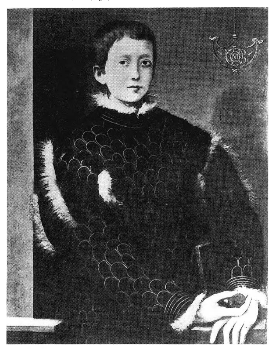
Figure 6. Ridolfo Ghirlandaio, Cosimo de' Medici at Age Twelve, 1531. Oil on panel, 86.5 x 66.5 cm. Florence, Uffizi, Inv. Ville 1911, Castello no. 274 (Photo: from G. Poggi, "Di un ritratto inedito di Cosimo de' Medici, dipinto del Ghirlandajo nel 1531," Rivista d'Arte, IX (1916-18), Fig. 1).

A star sì mesto, il suo gioir, ch'infinge In lei sempiterna, allegro Ti renda, non dirò, ma tempri in parte, La noia che comparte La carna inferma al cor doglioso. . .[sic].<sup>50</sup>