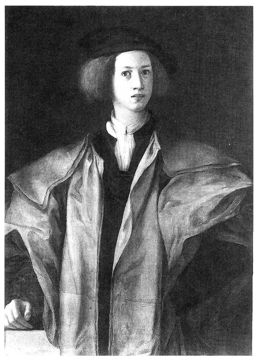
Figure 7. Pontormo (Jacopo Carucci), here identified as Giulio d'Alessandro de'Medici, ca. 1544-46. Oil on panel, 85 x 61 cm. Lucca, Pinacoteca.

Lucca boy. Neither have offered an alternative proposal; as recently as 1990, Luciano Berti also left the identification of the youth open.<sup>76</sup>