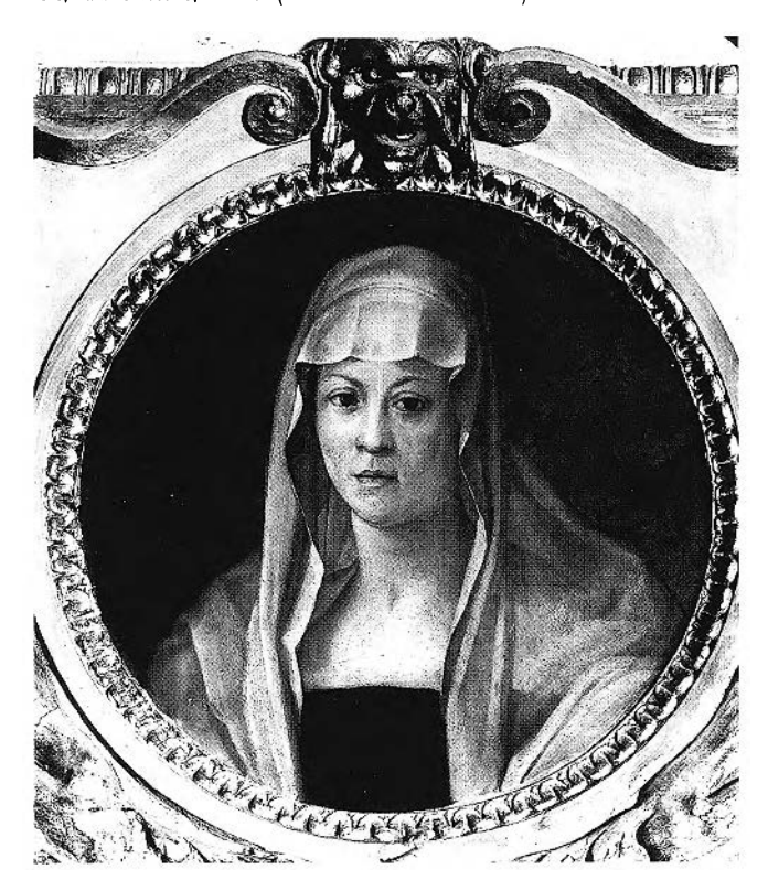
Figure 3. Giorgio Vasari, Maria Salviati de' Medici , 1556. Fresco. Sala Giovanni delle Bande Nere, Palazzo Vecchio, Florence.

against a pilaster, symbol of fortitude, fulfilling a decorum only recently prescribed by Castiglione, a sprezzatura that augments the implied courage of a potential man of arms. The pilaster may also be a veiled reference to the new Medici principato under the protection of the Emperor Charles V, one of whose imprese showed the eagle between two pillars. <sup>29</sup> Finally, the identity of this boy raised from birth as the legitimate Medici scion is elaborately inscribed in the upper right field, COSMO.MED.