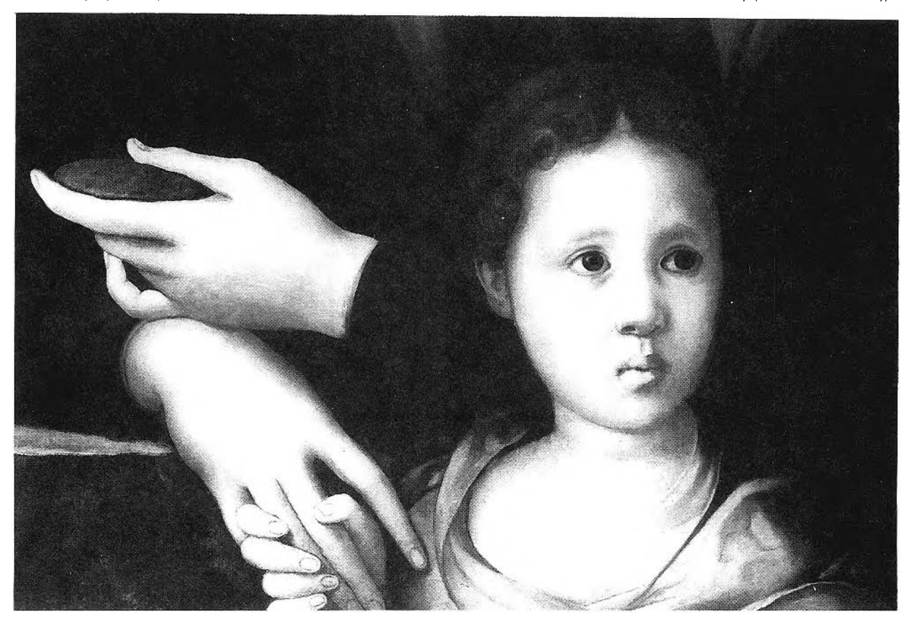
Figure 2. Pontormo (Jacopo Carucci), Maria Salviati with Giulia d'Alessandro de' Medici, circa 1540, detail, Giulia de' Medici. Baltimore, Walters Art Gallery.

This last portrait is a copy of Ridolfo Ghirlandaio's Portrait of Cosimo de' Medici at Age Twelve of 1531 (Fig. 6), and Pontormo's profile portrait of 1537 is the source for another portrait of Cosimo as a youth in this setting. Oddly, the Baltimore child does not reappear in the cycle or in any of the multiple sets of Medici family portraits commissioned by Cosimo. These include Medici children from babyhood to adolescence.<sup>22</sup>