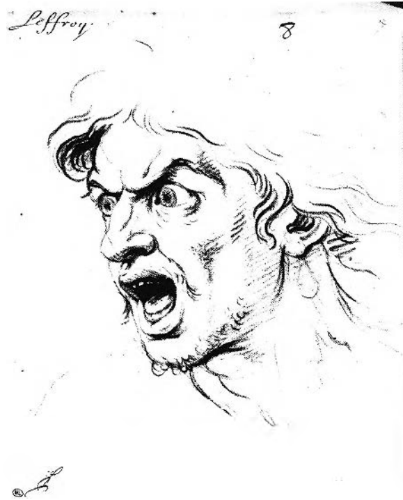
FIGURE 96. Le Brun, " Leffroy " or Terror , ca. 1668. Brownish-grey chalk, 25 × 20 cm., Paris, Louvre, Cabinet des Dessins, Inv. No. 6497 (Cliché des Musées Nationaux, Paris).