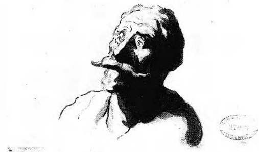
FIGURE 111. Daumier, Head of a man , ca. 1860-69. Black chalk and watercolour washes, 13.8 × 24 cm., Paris, Ecole Nationale Supérieure des Beaux-Arts.