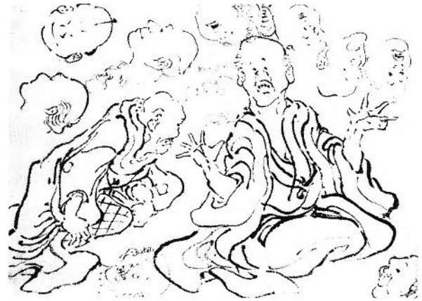
FIGURE 109. Katsushika Hokusai. Page of miscellaneous figures , Edo period, ca. 1830. Black ink (brush) on paper, Washington, D.C., Freer Gallery.