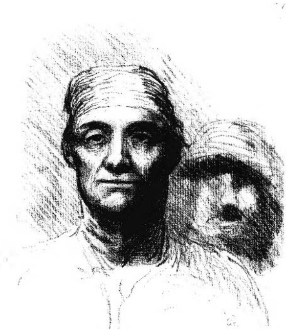
FIGURE 98. Daumier, Two heads of men , 1840s(?). Black chalk, 16.7 × 15 cm., Museum Boymans-van Beuningen, Rotterdam.