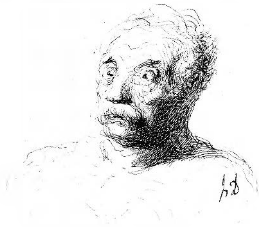
FIGURE 110. Daumier, Head of a man , ca. 1870. Pen and ink, 16.5 × 12 cm., Hartford, Conn., Wadsworth Atheneum.