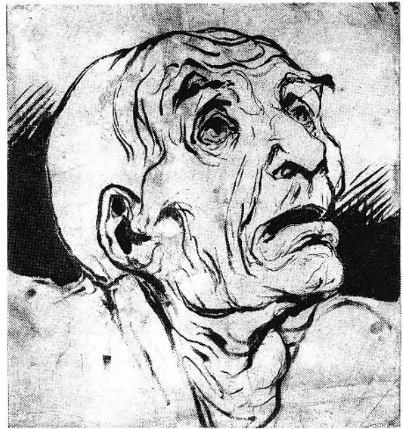
FIGURE 95. Daumier, Tête d'expression , ca. 1849-51. Brush and brown ink, 35 × 32.5 cm., London, British Museum.