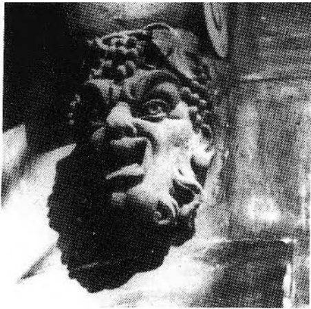
FIGURE 104. Antoine Barye, Mascaron (Silenus) , ca. 1851. Pont-Neuf, Paris.