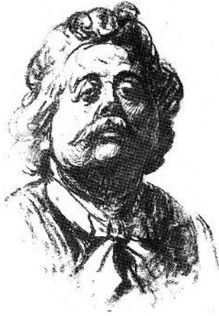
FIGURE 100. Daumier, Portrait of Carrier-Belleuse , 1863. Charcoal and stump, 43 × 28.5 cm., Paris, Petit Palais.