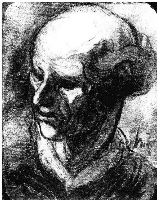
FIGURE 99. Daumier, Study of a Man's Head , ca. 1848-59. Black chalk, charcoal, brush and wash, varnished, laid on board, 23 × 18 cm., private collection.