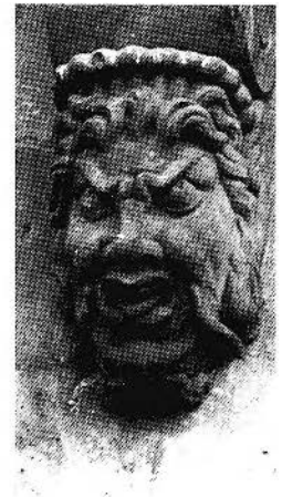
FIGURE 107. Antoine Barye, Mascaron , ca. 1851. Paris, Pont-Neuf.