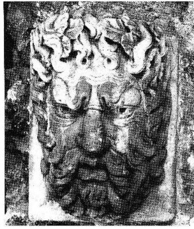
FIGURE 102. Anonymous French, Mascaron (Jaun) , ca. 1610. Paris, Musée de Cluny (formerly on the Pont-Neuf).