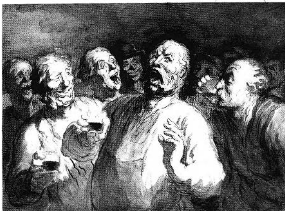
FIGURE 106. Daumier, La chanson à boire , ca. 1860-65. Black chalk, pen and ink and watercolours, 26 × 34 cm., location unknown.