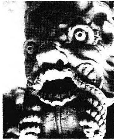
FIGURE 105. Anonymous French, Mascaron , ca. 1610. Paris, Musée de Cluny (formerly on the Pont-Neuf).