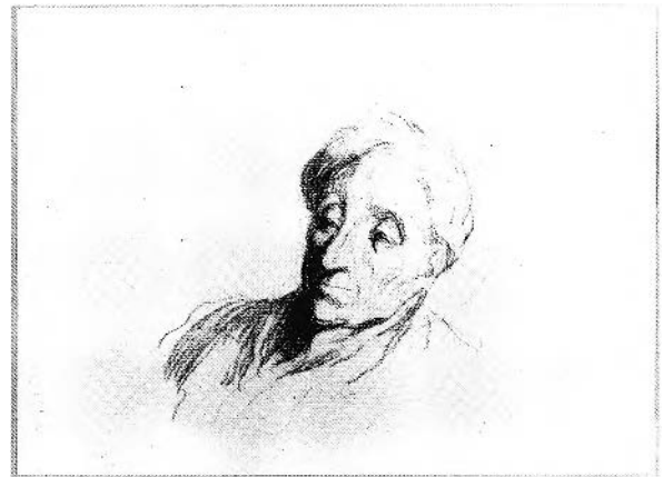
FIGURE 97. Daumier, Head of a man (the historian Michelet?), ca. 1851. Sanguine, 23 × 30.2 cm., present location unknown (Photo: K. E. Maison).