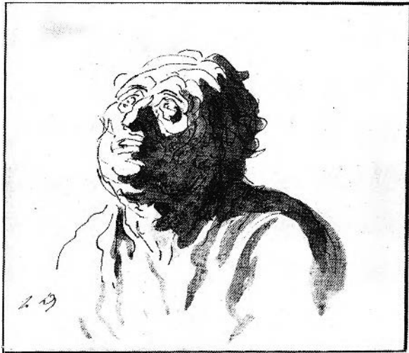
FIGURE 108. Daumier, Head of a man , ca. 1870. Pen and wash, 10 × 11.5 cm., London, Mr. F. M. Gross.