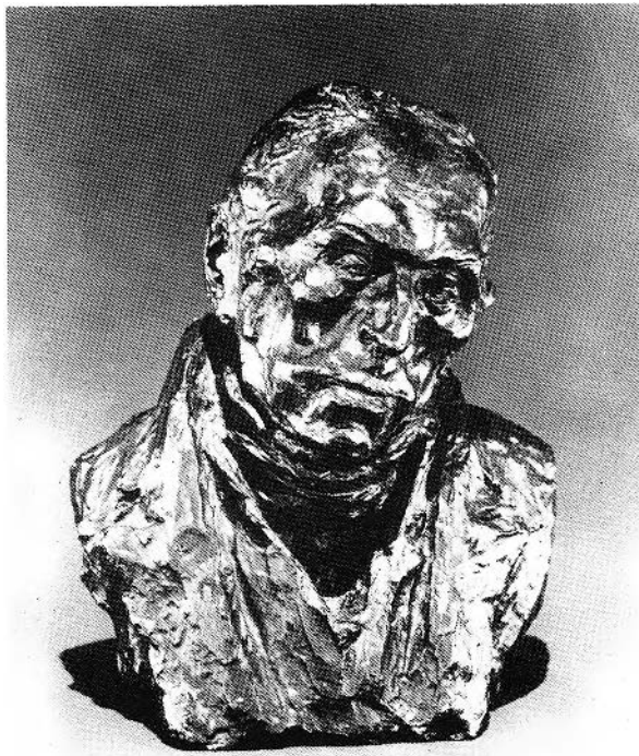
FIGURE 94. Daumier, Head of Guillaume Guizot, ca. 1833. Bronze cast from clay, ht. 22.1 cm., the Armand Hammer Daumier Collection.