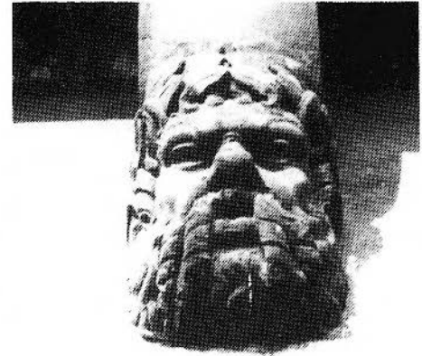
FIGURE 103. François Milhomme(?), Mascaron , 1817. On terre-plein of the Pont-Neuf, Paris, 1817.