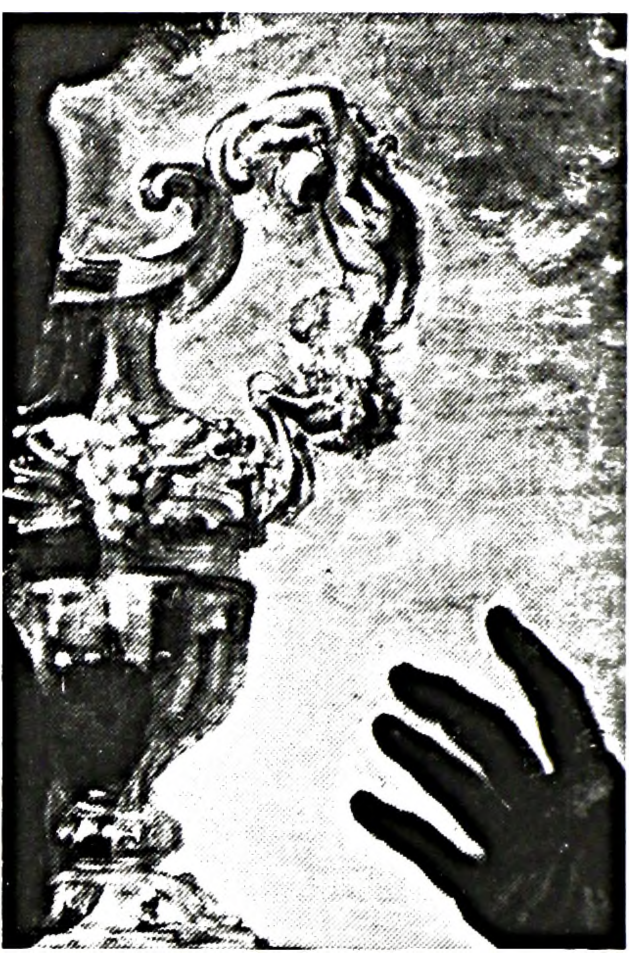
FIGURE 2. Samson and Delilah, detail of the wine ewer.