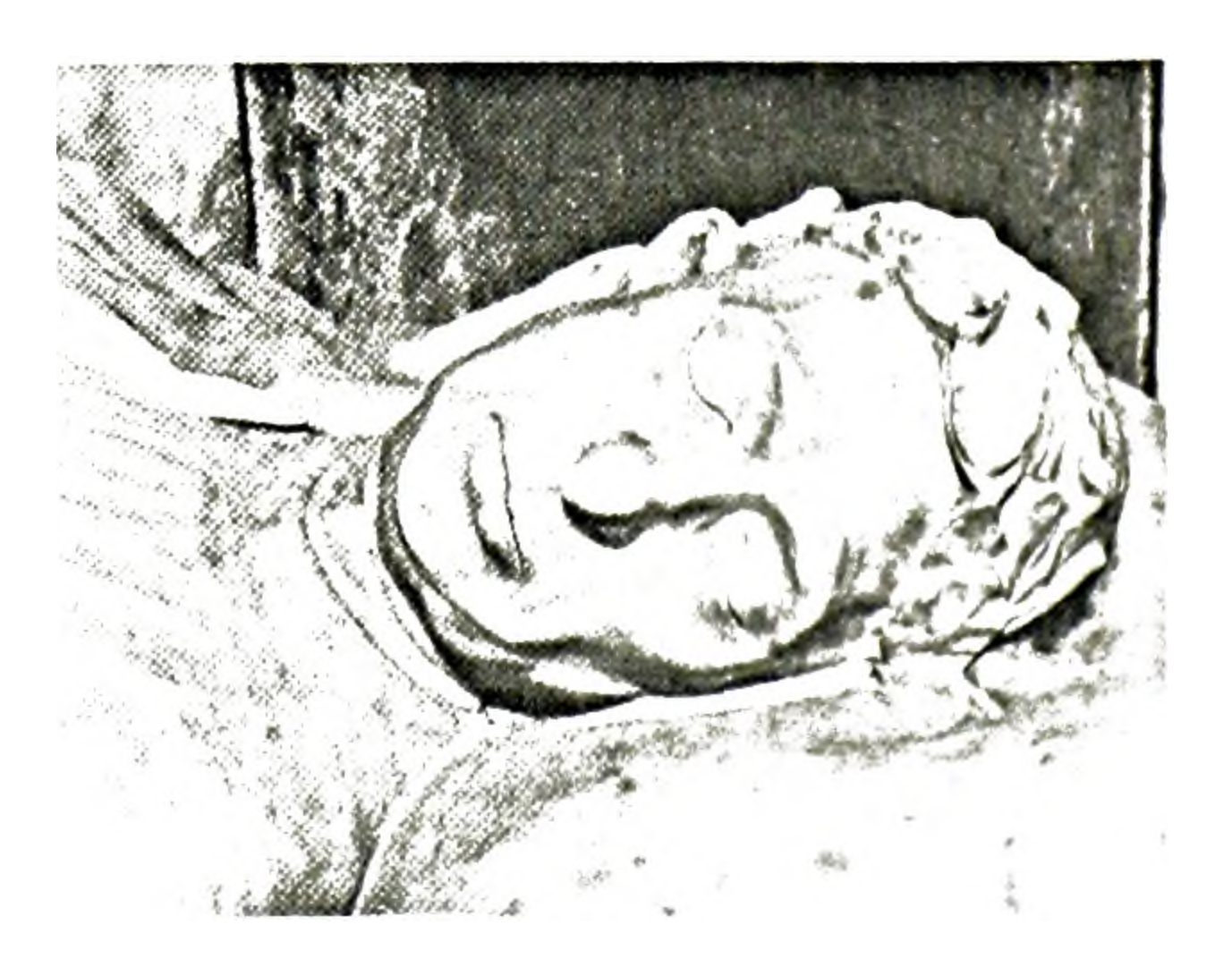
FIGURE 1. Bernardo Rossellino, Tomb of Leonardo Bruni (detail).

The author, however, is in firm pursuit of another goal, the 'classification according to hands of the individual portions of all the monuments and identification of one of those hands with the master of the shop.' Nothing so simple here as the assigning of figures to different masters, but a thoroughgoing analysis of every sculptural component placed against a rigor-