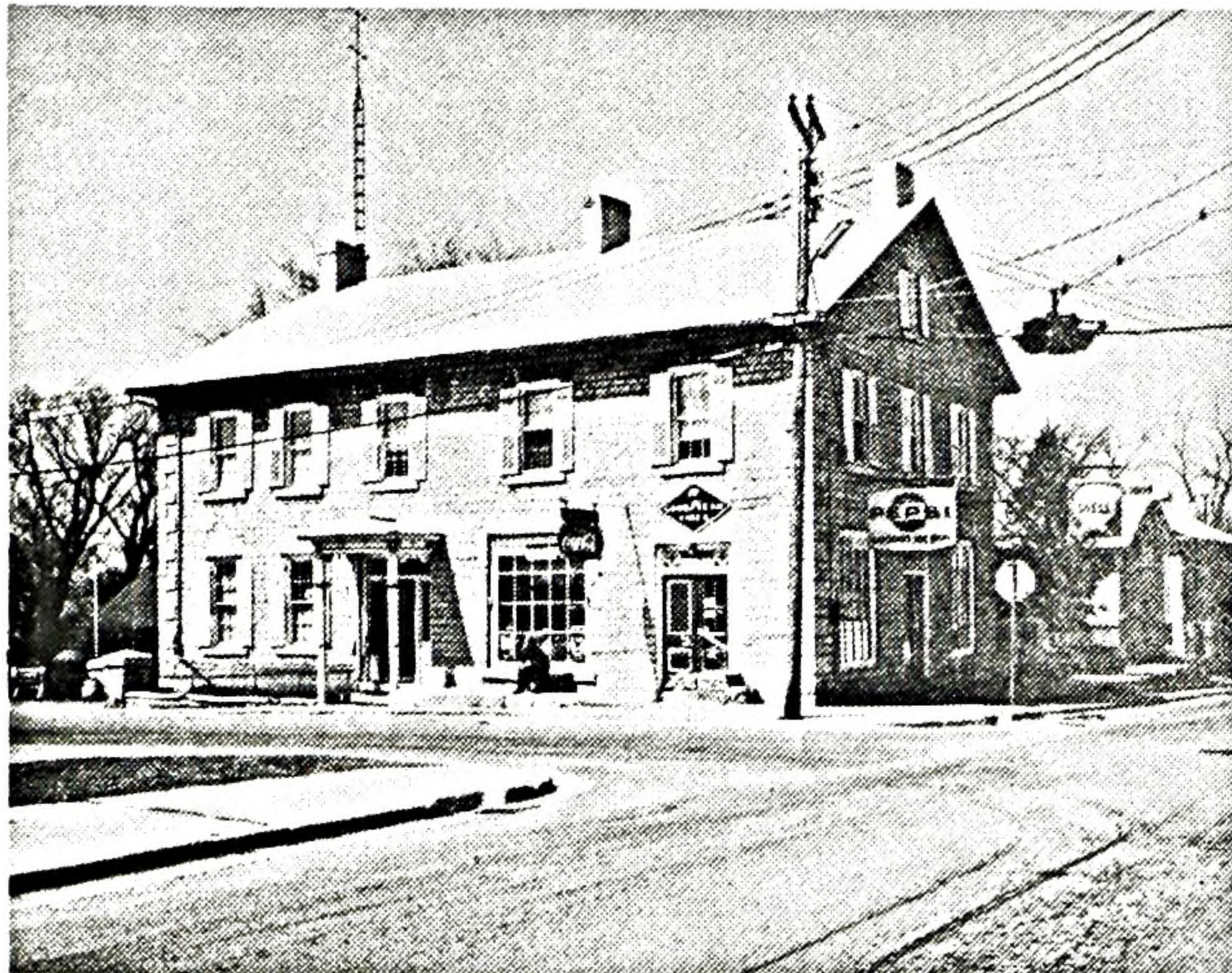
Camden East. Ontario Towns , pl. 67.

is carefully studied and posed; Greenhill's style is one of classical perfection befitting the style of building that he likes best. 1