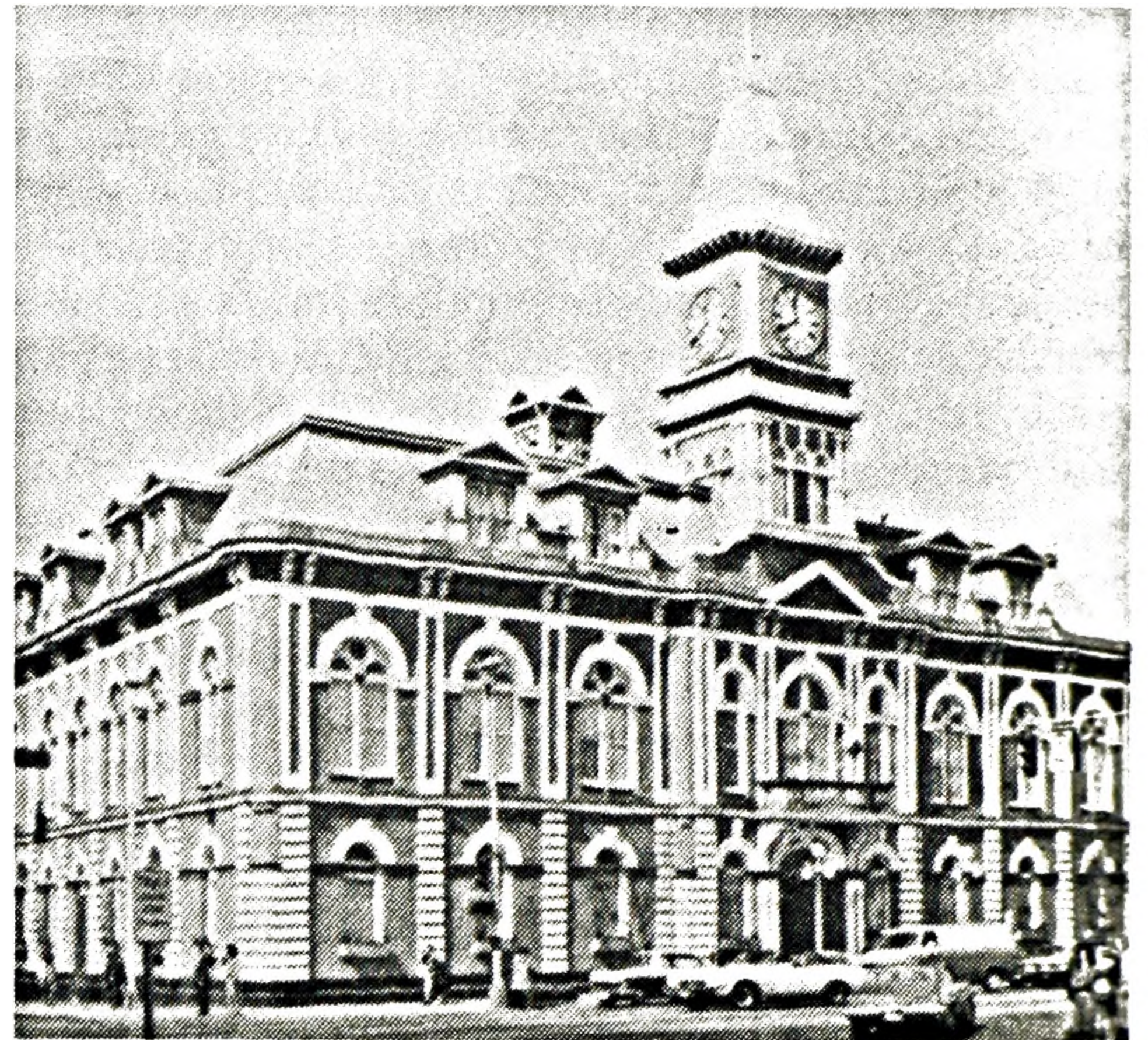
Victoria City Hall. Heritage Conservation Report , p. 18.

order (again separated into building types), enable the reader to gain a real feeling for the essence of Victoria's architectural development. A great deal of architectural history has been tightly compressed into a restricted format and the material is almost all new.