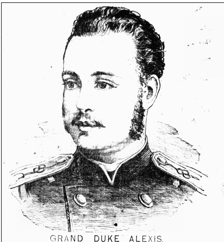
GRAND DUKE ALEXIS.

My friends, what's the matter, Who's raising this noise, Where are people going,