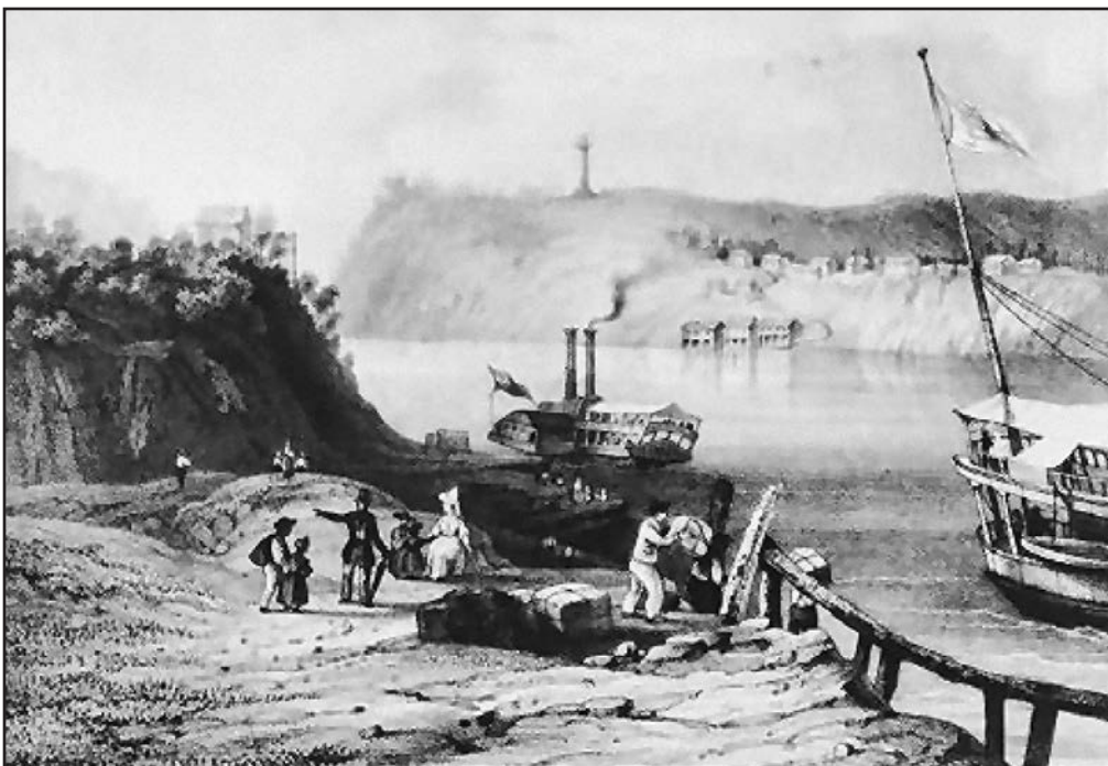
As W.H. Barlett's 1840 painting makes clear, Brock's monument was created to be seen prominently from the American side of the river.

ing angularity' of their New York modular skyscraper. The practical objectives which redesigning the city might accomplish were firmly subordinated to the symbolic representation of function.