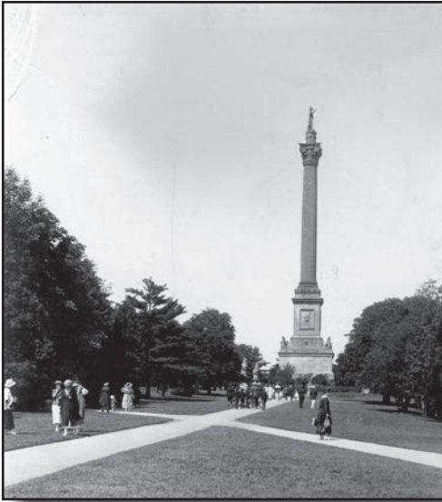
The Brock monument as a twentieth-century tourist attraction.

Niagara Escarpment, where the Battle of Queenston Heights was waged. It was intentionally massive because, to quote a Parks Canada pamphlet, the monument and the battlefield are “instrumental in demonstrating the determination of the Crown and the populace to defend British North America, and in contributing to the development of Canadian national consciousness.” 66