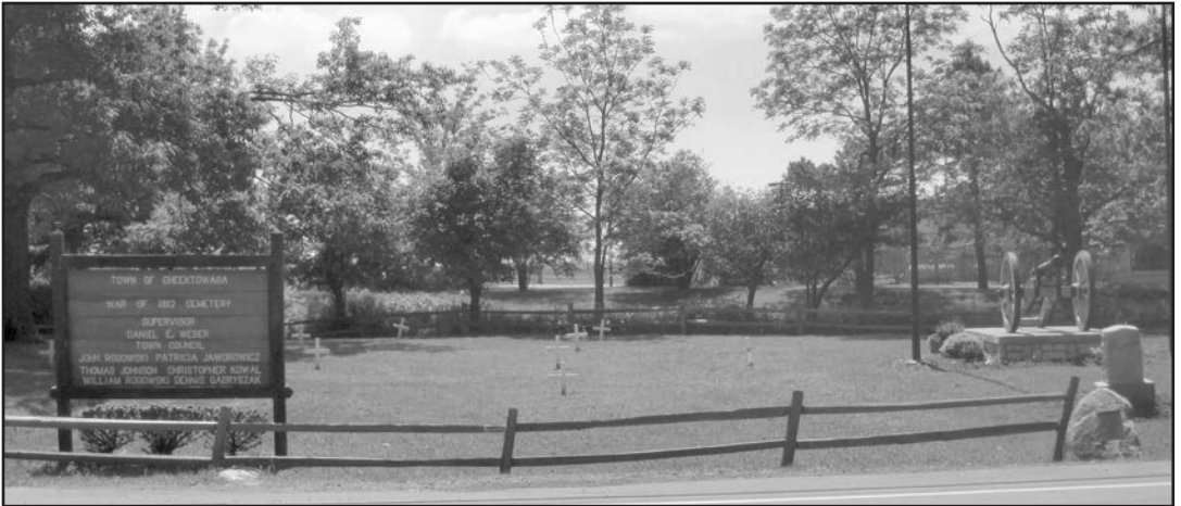
The War of 1812 cemetery in the Town of Cheektowaga, New York.