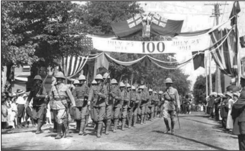
All branches of the Canadian military also attended, including the 44th Regiment seen here, marched from the luncheon at the nearby Clifton House to the battlefield. Courtesy of Niagara Falls Public Library (Ont.) D417054.

below. Although ostensibly a celebration of friendship and peace between the two countries, the event emphasized the Canadian military and its connection to Britain at the expense of the American forces who also fought in the battle. Again, it seems that the LLHS made efforts to ensure that the celebration would emphasize Canada's attachment to Great Britain as much as possible despite the inclusion of American representatives. The society could not, however, control how the speakers would balance the two commemorative themes of the day, or what attitudes they would express towards the United States.