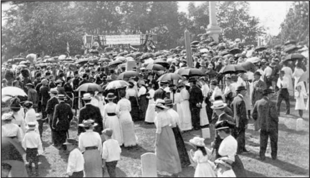
Sizeable crowds attended the centennial celebrations of the Battle of Lundy's Lane in 1914.

and with the help of the Ontario Historical Society campaigned for the erection of a monument to Laura Secord, unveiled in 1901. 26 They also called for the property to be transferred to the Queen Victoria Niagara Parks Commission in 1910, which enhanced the site by installing paths, repairing fences, restoring gravestones, and planting flowers. 27 The members of the LLHS understandably saw themselves as the guardians and proprietors of the site, and were therefore the obvious choice to propose and organize the celebrations to be held there in 1914. The society also had a great deal of experience organizing historical celebrations, and these often favoured ties with Britain