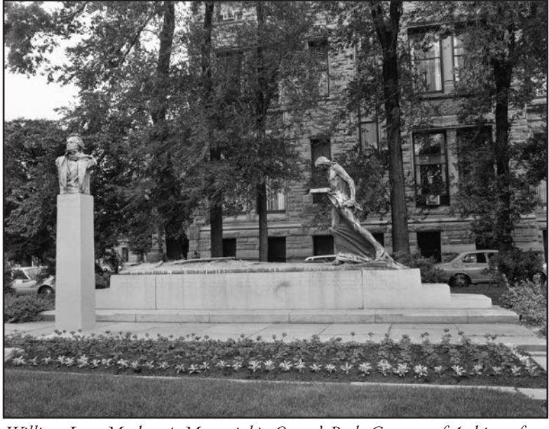
William Lyon Mackenzie Memorial in Queen's Park.

tute as Mackenzie King could seize upon. To mark each of these four phases—heroic revisionism, rehabilitative consensus, suppression of opposition material, reconfiguration of popular historical narrative—I have selected a representative,