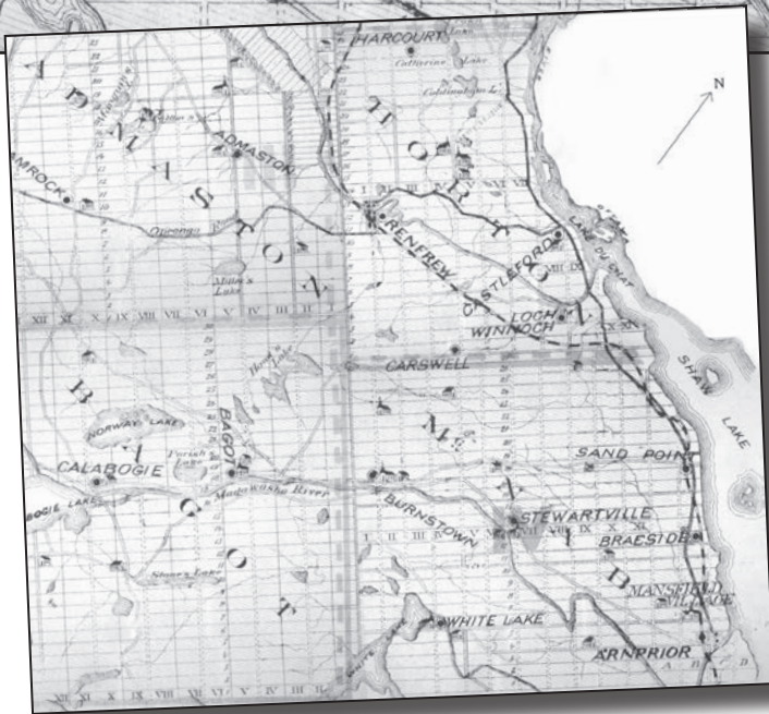
Above: McNab Township, part of Renfrew County, as seen in 1880, courtesy of the Canadian County Atlas Digital Project, < http://digital.library.mcgill.ca/County/Atlas >.