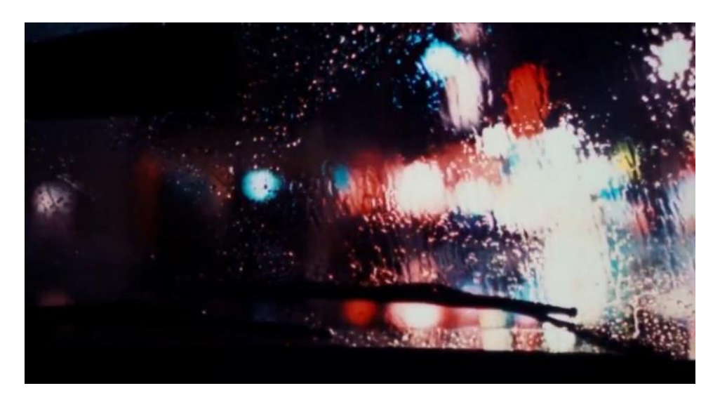
Figure 7: Keeping things enigmatic.

the film does not make this conclusive. Instead of using this moment to embellish the narrative, Scorsese keeps the scene enigmatic (Figure 7). Betsy is dropped off and the taxi drives away. The viewer watches as she turns and abandons them. The taxi embodies isolation, loneliness, and imprisonment. The limited vision of Travis' face confined in the rear-view mirror embodies this as well. The quick and sharp change in the imagery and music disturbs and confuses the viewer. The visuals seem to speed up and the smooth jazz is interrupted by an eerie sound. It is an editing style of experimental cinema which, "derails perception from its stable center, shuffling it along an unpredictable path of movements" (Flaxman, 22). This conveys the violent sensation that reality has collapsed for Travis. The viewer's reality is also distorted because they have been immersed in and interacting with the universe of the film. The viewer's reality is the film, similar to how Deleuze states that the brain is the screen. The film constantly affects the viewer in ways they did not consent to, since the images shown are unconventional and unexpected by the viewer. A does not move to B in a linear organic way. There is no distinction and therefore no progress. The viewer no longer even has the certainty that A was the beginning and B was the end. These temporal points of reference disappear.