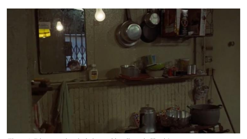
Figure 3: Disconnection, isolation and loneliness in Travis's apartment.

order, thereby realizing the ["molecular"] essence of the image" (Flaxman 2000, 19), which is especially powerful in the Time-Image. It is charged with lines of flight that allow the viewer to feel the "molecular" universe for themselves without "molar" intermediates. The apartment is part of a "molecular" universe, beyond being the place Travis inhabits. In a particular image from inside the apartment, the viewer is forced to watch Travis eat alone again. There is limited vision of one side of Travis through the reflection of a confining mirror, while the other side of Travis is also confined by metal grates on the window. This causes a feeling of claustrophobia. The light bulb and reflection of the light bulb elicits an impression of repetition, suggesting the viewer and Travis are again stuck in a loop. The surrounding walls are murky green and old, evoking a sort of nauseating bleakness. The apartment isolates the viewer and Travis in a becoming(-) space. Bowls, kitchen appliances, cereal boxes and other miscellaneous items are stacked in an attempt to be organized. Nothing in this setting gives an indication that there is a connection to other bodies from the world outside the apartment evoking a sense of isolation and loneliness in not only Travis, but encouraging it in the viewer as well (Figure 3).