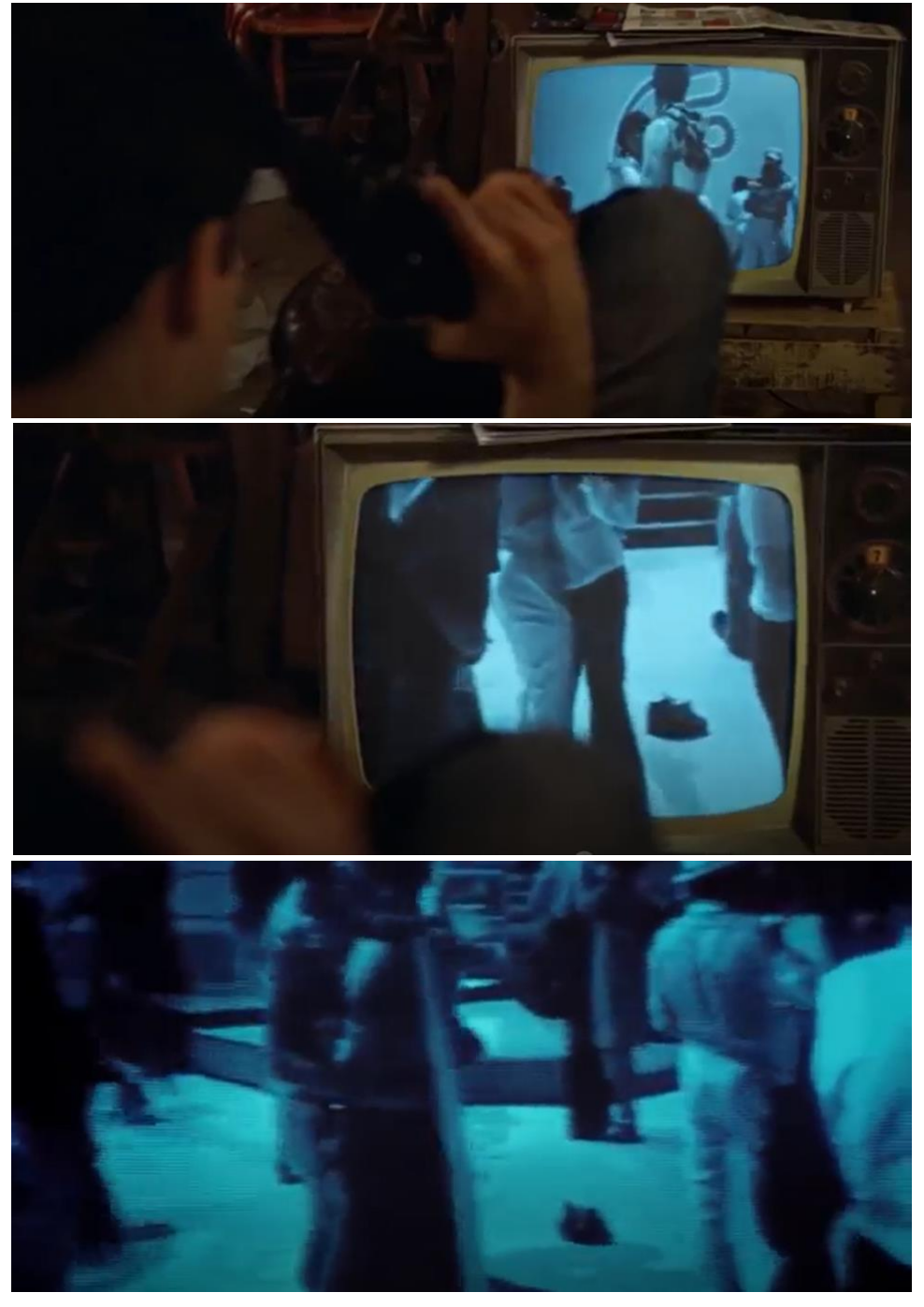
Figures 3-5: Sinking into the image, evoking in-betweenness.