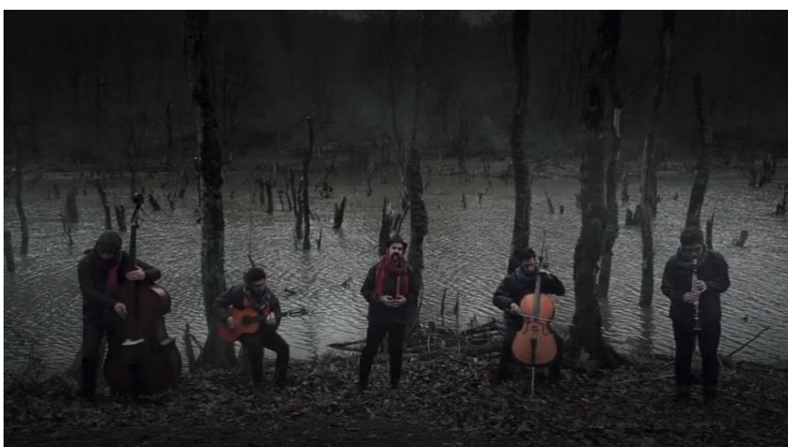
Figure 2: A performance by Pallett.