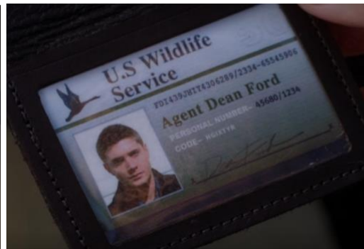
Figures 3 and 4: The U.S. Wildlife Service IDs used by Sam and Dean in the Season 15 episode "Proverbs 17:3" (15.5)