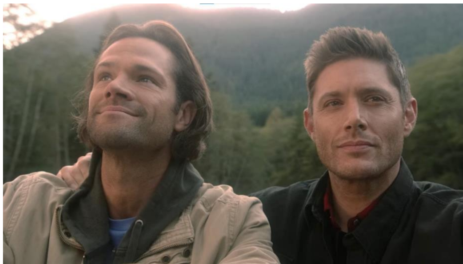
Figures 10 and 11: The clothes Sam and Dean wear in the pilot episode (1.1 top) are reproduced in the final scene of the series finale episode "Carry On" (15.20 bottom).