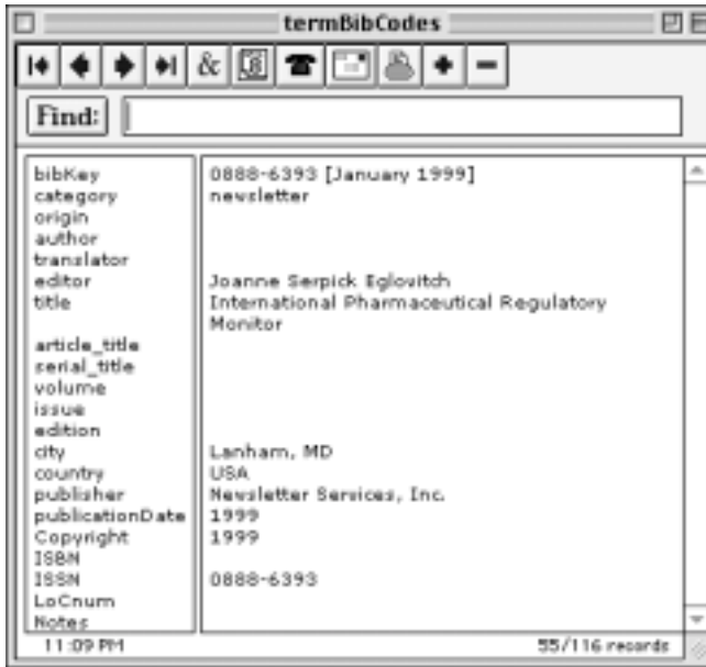
Figure 3. A Sample Bibliographic Entry

The above data fields are modeled on the ISO 12620 data categories as shown below (author's comments appear in italic).