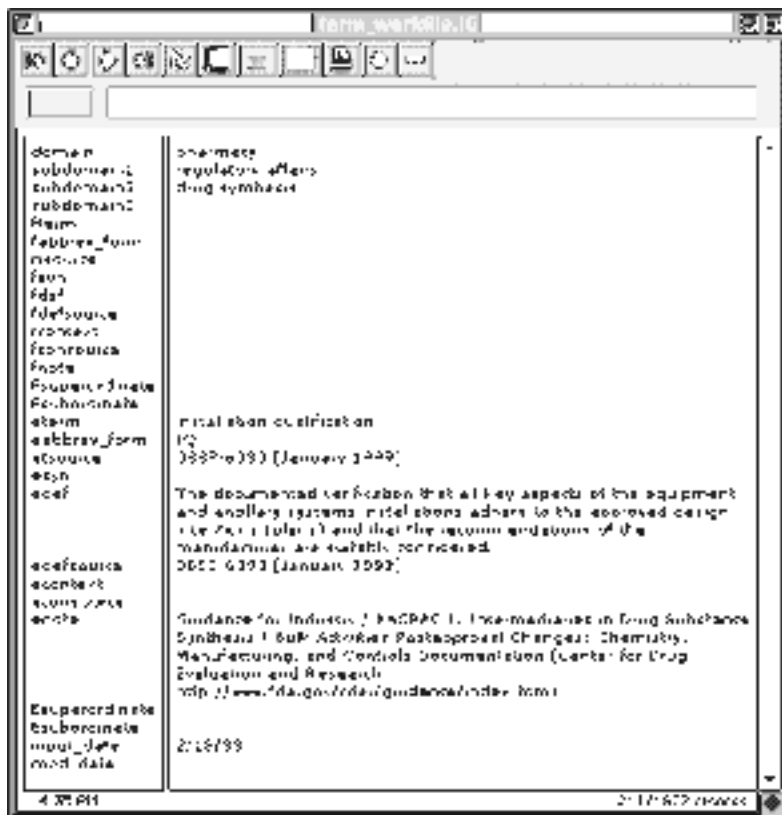
Figure 1. A Sample Term Entry

The following illustration is a screen shot of an unfinished bilingual (English and French) term record created with Infogenie. Information about an English language term (eterm) has been entered with no equivalent French data (fterm, fdef, fcontext, etc.). The data categories follow the ISO 12620 registry very closely. In the illustration, the following data categories are concept related: domain, subdomain1, subdomain2, subdomain3, fdef, fcontext, edef, econtext, fsuperordinate, fsubordinate, esuperordinate, and esubordinate. Term-related categories are represented by fterm, fabbrev_form, fsyn, eterm, eabbrev_form, esyn. The fnote and enote categories correspond to a separate note data category in ISO 12620. The fields for input_date, mod_date, ftsource, etsource are covered by 12620's Administrative information categories (subgroup 10).