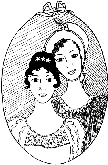
Indeed they are sweet Girls— Sensible yet unaffected— Accomplished yet Easy— Lively yet Gentle—