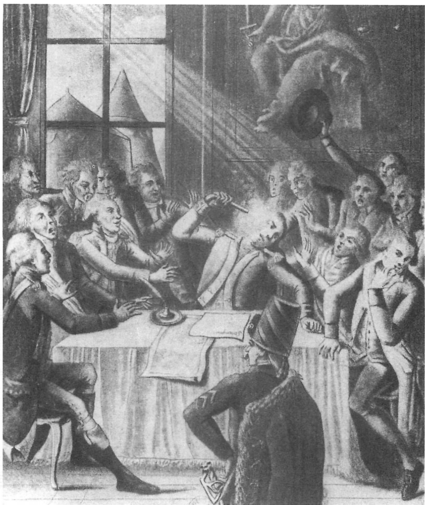
Illustration 4 Bibl. Nat Mort de Beaurepaire.