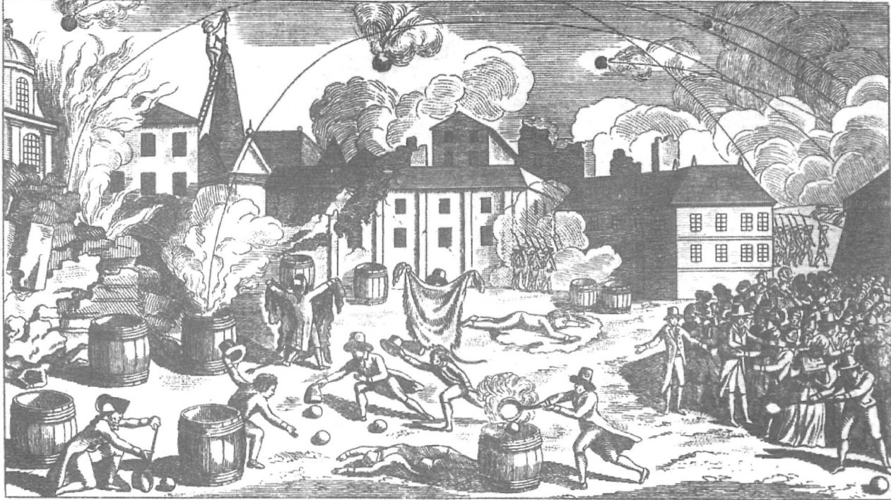
Les derniers jours de Septembre 1792, la Ville de Lille, fut bombardée par les autrichiens animés par la présence de la souveraine des Pays-Bas qui donna le signal en mettant elle-même le feu à la première bombe: le courage de la garnison et des habitants rendirent inutile leurs efforts.