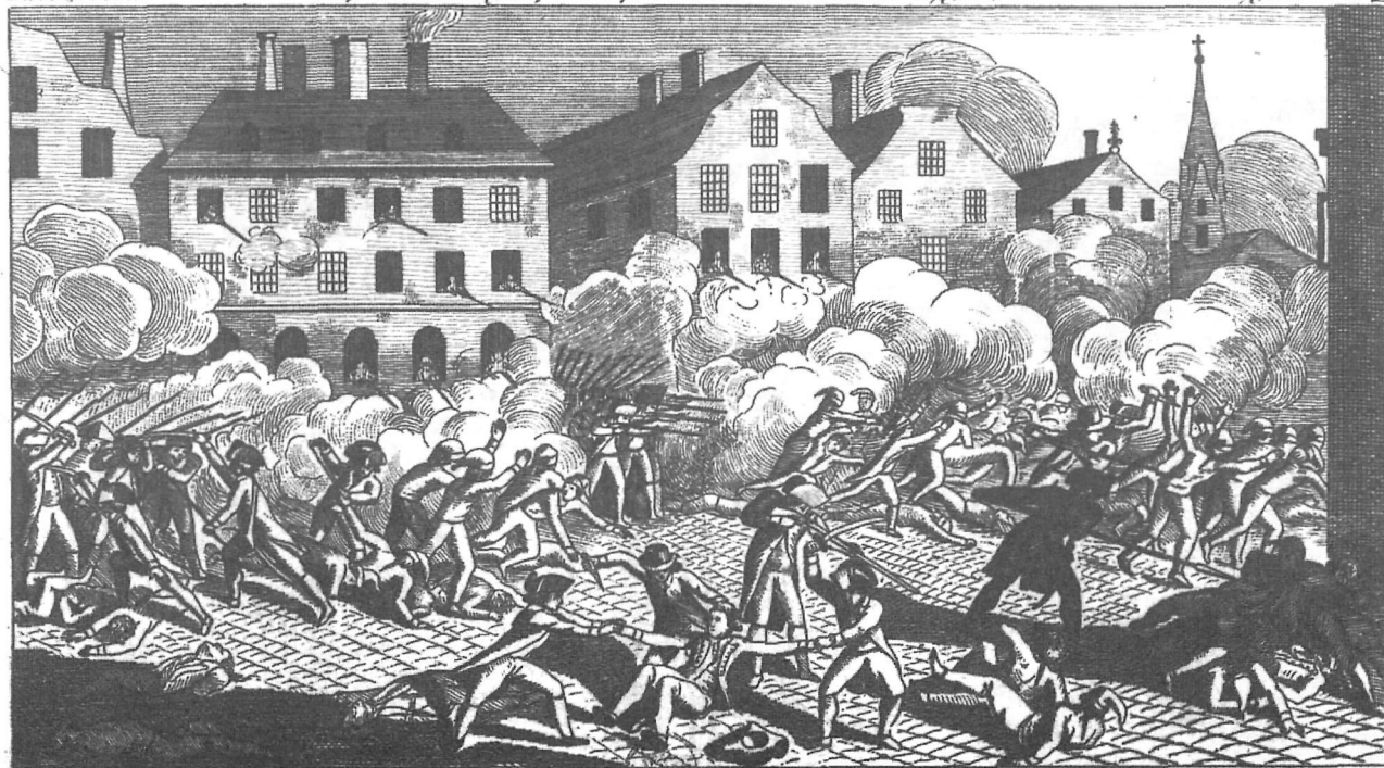
Le 2 Décembre 1792. Francfort a été repris par les Prussiens, d'après une trahison insigne. Environ douze cent Français ont été égorgés dans les Rues et places, par dix mille assés armés de couteaux au Siège de Peignard.