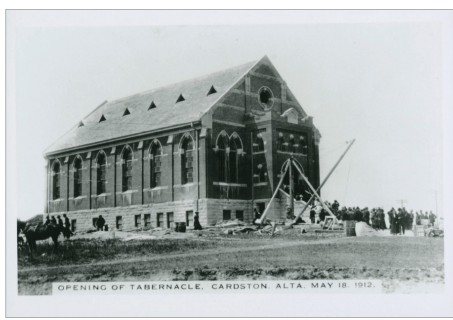
FIG. 2. THE CARDSTON TABERNACLE, 1912.

Card's attitude toward the "land desolation" was transformed, rather, when he learned about a prophecy made by Joseph Smith in 1843 that the "nation of Great Britain . . . would never persecute the Saints as a nation" and that at