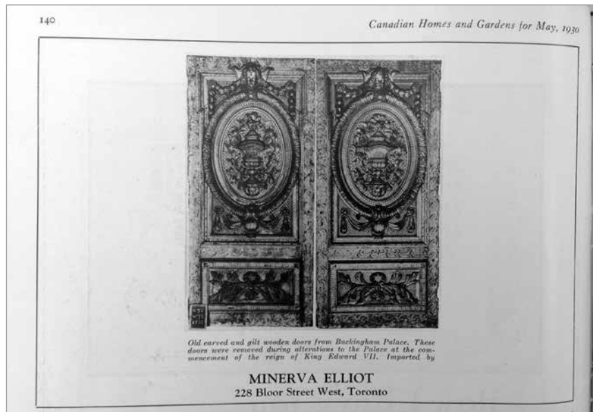
FIG. 4. ADVERTISEMENT FEATURING A PHOTOGRAPH OF GILT WOODEN DOORS FROM BUCKINGHAM PALACE. | CANADIAN HOMES AND GARDENS , MAY 1930, P. 140.

light and equipment, elaborate plumbing, and the accessories of rapid communication, such as motor cars, telephones and radios, have exercised new influences in the handling of a home, and changed, as well, people's lives and habits. There is a scarcity of domestic help; therefore, houses are planned, decorated and equipped with the view to keeping labor to the minimum. 33