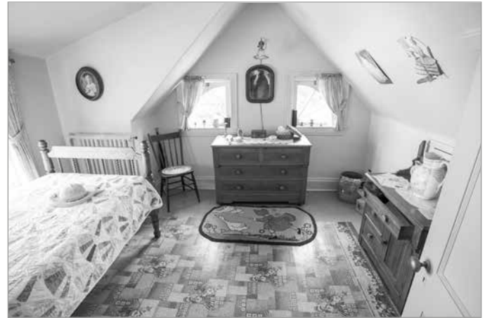
FIG. 13. THE "HIRED GIRL'S ROOM" IN THE WYATT HISTORIC HOUSE MUSEUM.