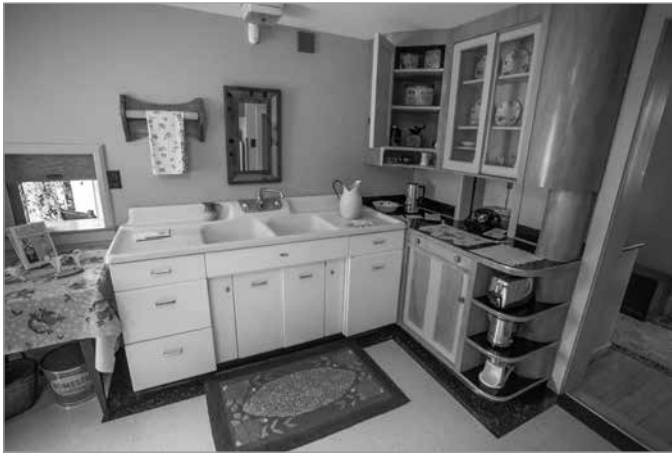
FIG. 12. A CORNER OF THE KITCHEN IN THE WYATT HISTORIC HOUSE MUSEUM, FEATURING THEIR KITCHEN QUEEN SINK. | ADAM KIRKEY, 2014.