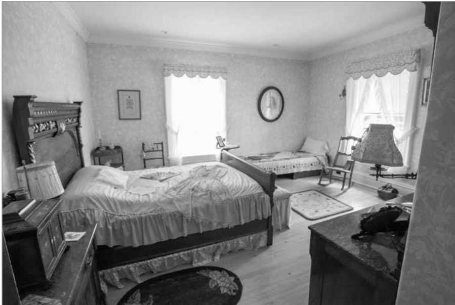
FIG. 10. WANDA WYATT'S BEDROOM UNTIL 1937. AFTER 1937—THE YEAR CECILIA WYATT PASSED AWAY—WANDA MOVED INTO THE MASTER BEDROOM OF THE HOME. | ADAM KIRKEY, 2014.