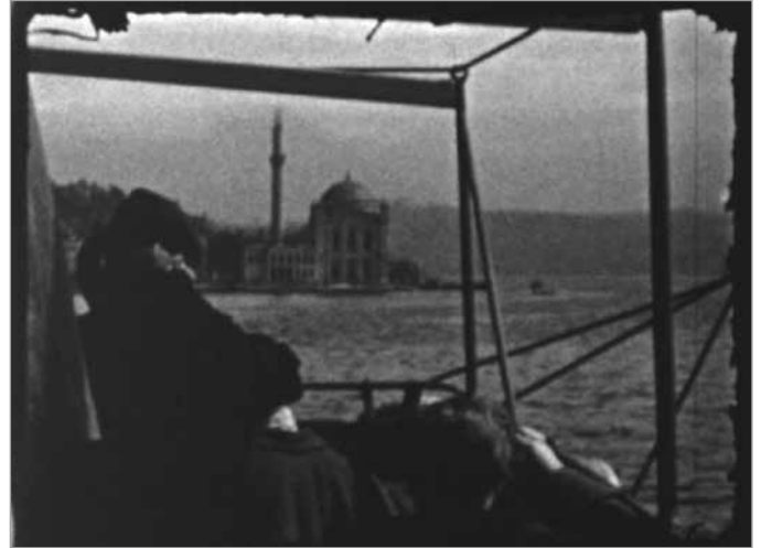
FIG. 6. FROM THE BOAT TRIP ON THE BOSPHORUS, TOWARD ORTAKÖY MOSQUE. STILL FROM HOME MOVIE.