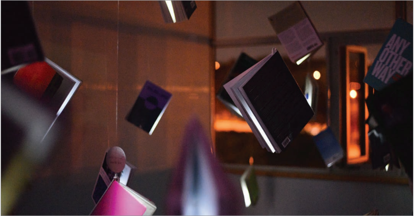
FIG. 5. "WHAT BINDS US" INSTALLATION AT THE ONTARIO ASSOCIATION OF ARCHITECTS MOVE PARTY ON SEPTEMBER 15, 2017. | AMINA LALOR.

education of the architect? How can we expose the biases and exclusions of the Western canon without discarding it altogether?" 8 She goes on to propose, as a starting point, to recognize that we are not trying to create a new canon out of the marginalia—the goal is not a new, alternate orthodoxy. The point is to show the interconnectedness of ideas, events, and voices. 9