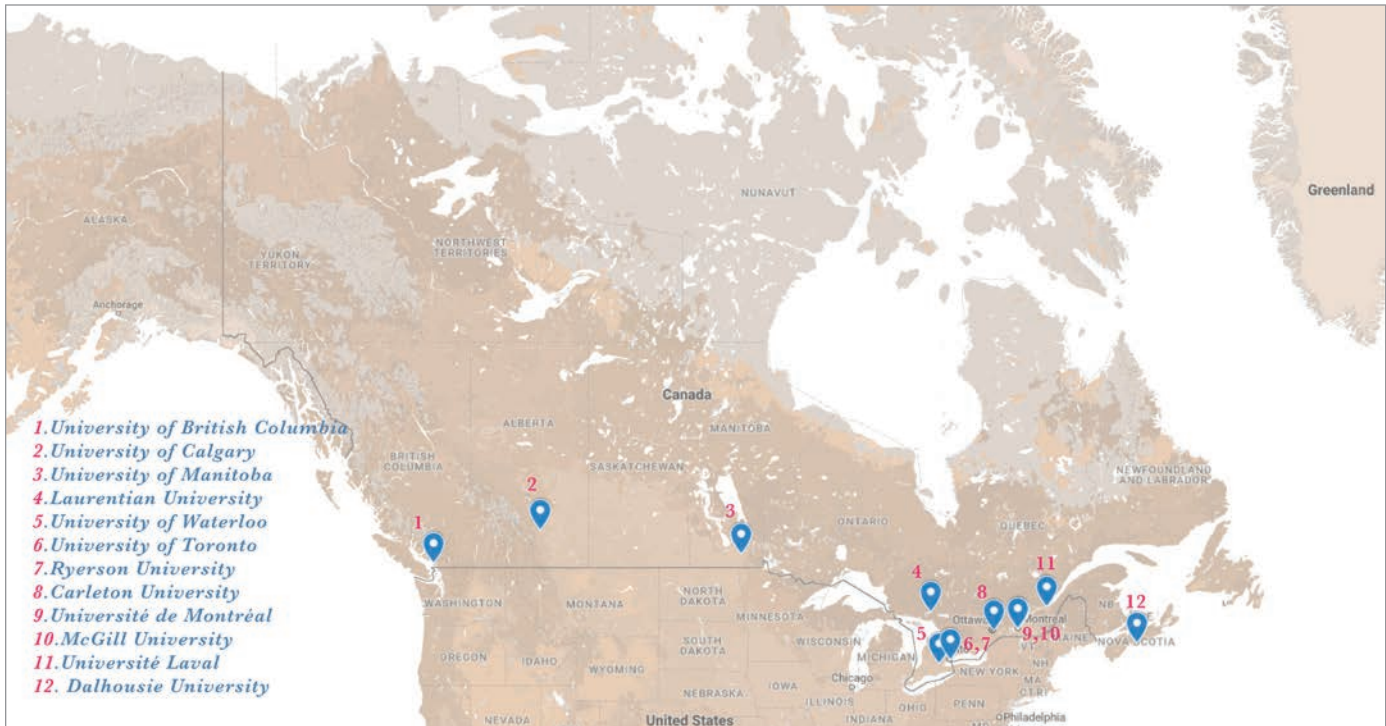
FIG. 2. CANADIAN SCHOOLS OF ARCHITECTURE LOCATED ACROSS CANADA. | BASE MAP SOURCED FROM GOOGLE MAPS, ALTERED BY AUTHORS.

agreements to share the land, for all to benefit from it. For most of us in Canada, it is because of these treaties—and their subsequent violations—that we are able to call this land home. We are all treaty people, both Indigenous peoples and settlers, historic and recent. But we forget this, or we are never taught it to begin with.