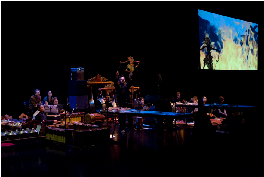
Figure 5. Gamelan Madu Sari performing “Semar in Lila Maya” in Vancouver with members from Wargo Laras.

gamelan, he was already exposed to two streams of musical output: karawitan (traditional music for gamelan) and new compositions.