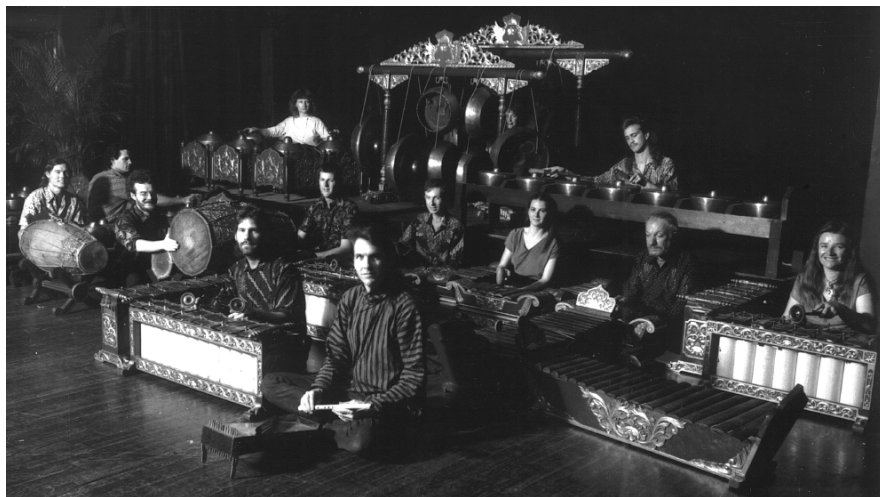
Figure 1. Gamelan Madu Sari in rehearsal at Simon Fraser University ca. 1988.

institution that formerly acquired the Javanese gamelan from the Indonesian government following the events of Expo 86. Meanwhile, the Western Front, already sympathetic to Indonesian arts, 5 hosted a night of Javanese shadow puppetry, which would be instrumental in SFU's acquisition of the instruments. Although the two differ greatly in nature, a crucial link between both institutions is their dedication to the interdisciplinary arts. 6