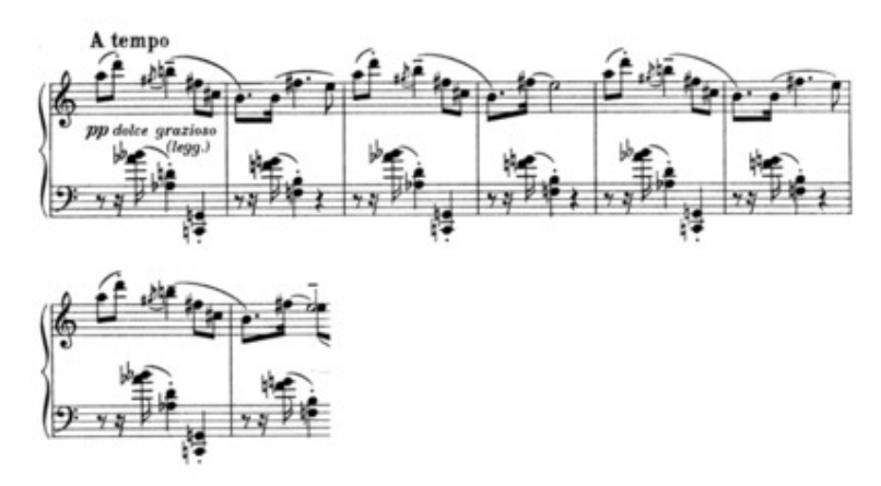
Example 2. Dissonant structure superimposing many layers, in Szymanowski, Mazurka op. 50, no. 19, mm. 13–20. Karol Szymanowski "Mazurkas | für Klavier | op. 50". © Copyright 1926 by Universal Edition A.G., Wien. www.universaledition.com

The striking feature of this passage is the extent of harmonic disagreement among its component parts. These include the bagpipe fifth on C,<sup>11</sup> some broken dominant sevenths alternating between B<sup>b</sup> and G (suggesting octatonicism), and a melody (suggesting pentatonicism) that is probably centred on B—or is it on E? With so many conflicting tonal influences and modal collections, and with only conflicting harmonic support, it is rather difficult to tell. How, then, is one to categorize the whole combination? It isn't clearly bitonal, it isn't really "polytonal" (i.e. built of more than two pitch centres), it isn't whole-tone, octatonic, or pentatonic, yet it certainly isn't atonal, with so many elements evidently taken from the tonal and modal vocabulary.<sup>12</sup> The issues of modality and key centre need to be addressed.