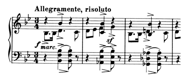
Example 1a. Free parallel fifths from the Mazurka op. 50, no. 4, mm. 1–3. Karol Szymanowski "Mazurkas | für Klavier | op. 50". © Copyright 1926 by Universal Edition A.G., Wien. www.universaledition.com