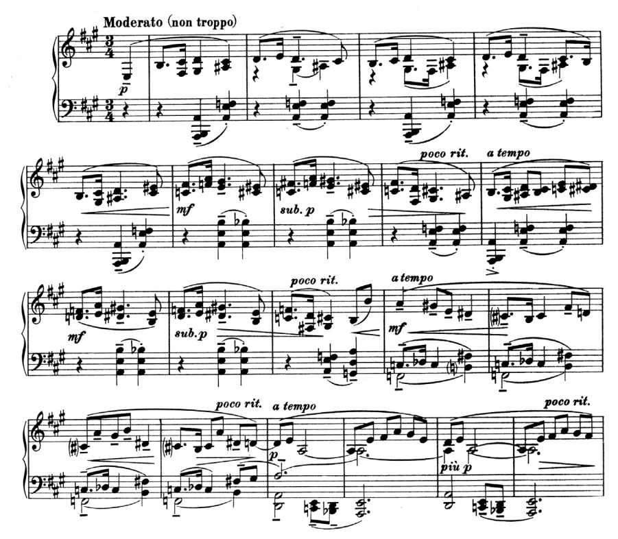
Example 11: Opening suggesting an A tonic, but with Szymanowski clashes against A/A#, E/F, and C/C#: Mazurka op. 50, no. 8, mm. 1–20. Karol Szymanowski "Mazurkas | für Klavier | op. 50". © Copyright 1926 by Universal Edition A.G., Wien. www. universaledition.com

In the more dance-like section in mm. 21–32, the tonic of E is crystal clear by comparison. Now the opening section on A can be heard as a ruse; it has acted all along as a prolonged subdominant before the work's true tonic of E. The A-A# conflict that played such an important role in the first section (m. 1–20) is heard in its purest form in m. 21, as a traditional Szymanowski clash on the fourth scale degree between the subdominant (A) and the characteristic raised fourth (A#) in the Podhalean mode. In this eighth mazurka, Szymanowski has creatively exploited the tensions of this underlying conflict.