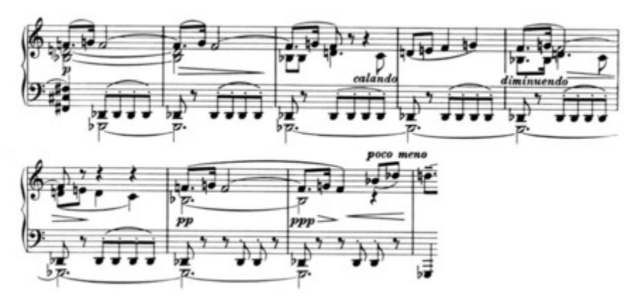
Example 1b: Conflict of G-flat vs. B-flat tonal regions in the Mazurka op. 50, no. 4, mm. 27–34. Karol Szymanowski "Mazurkas | für Klavier | op. 50". © Copyright 1926 by Universal Edition A.G., Wien. www.universaledition.com

of conflict or instability during the main body of the piece are taken up again and resolved in the coda. In this mazurka, the Bb tonality in the right hand gradually gains supremacy over the Gb bagpipe—a rare example in which the treble wrests harmonic control away from the bass. Perhaps this turn of events explains the Gb bagpipe's violent protestations in the form of gruff sforzando chords (mm. 99–100). As a final bit of mischief, the right hand ventures off onto a G major triad in 112–14: a new sonority departing from the dissonant major-third relationship noted above. At the very end, though, Bb is sonorous and firmly in control, subito ff. The closing cadence consists of no more than an emphatic statement of this open fifth on this Bb.9