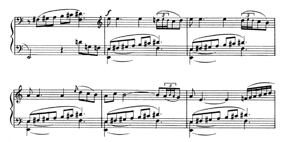
Example 4. Mode mixture as employed by Bela Bartók, Six Dances in Bulgarian Rhythm, no. 1, mm. 3–8, from Mikrokosmos, vol. 6. Dance in Bulgarian Rhythm no. 1 from Mikrokosmos by Béla Bartók. © Copyright 1940, 1987 by Hawkes & Son (London). Reprinted by permission.

All in all, clashes occur frequently in this mazurka on scale degrees 3, 4, 6, and 7. Analysis of clashes by scale degree will be taken up in the last section.