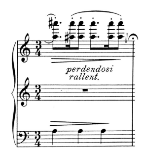
Example 9: Szymanowski clash on the tonic note: Sheherazade, op. 34, no. 1, mm. 5–9. "Masques, op. 34" © 1919 by Universal Edition A.G., Wien/UE 5858. Karol Szymanowski "Masques | 3 Morceaux | für Klavier|op. 34". © Copyright 1919 by Universal Edition A.G., Wien/UE 5858. www.universaledition.com

When the Szymanowski clash takes place on the tonic against its chromatic upper neighbour, it tends to imply vigorous bitonal competition.<sup>46</sup> It can even imply an entirely false tonic. A very interesting case of bitonal conflict can be found in the Mazurka op. 50, no. 5, which is among the most dissonant of this set.