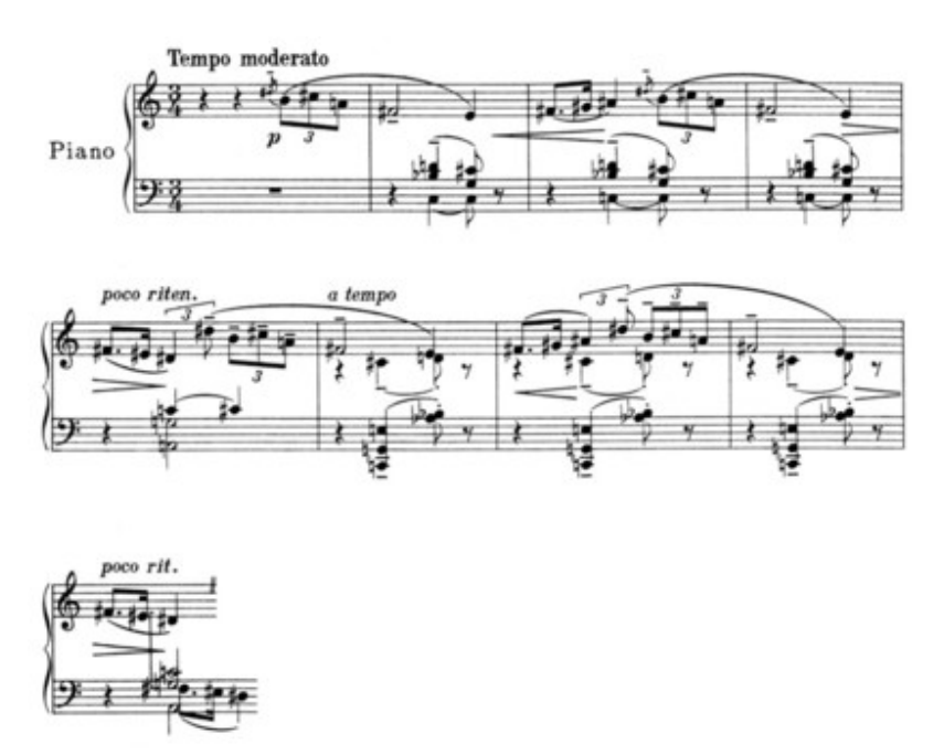
Example 5: A complex problem of locating a key centre: Mazurka op. 50, no. 9, mm. 1–9. Karol Szymanowski "Mazurkas | für Klavier | op. 50". © Copyright 1926 by Universal Edition A.G., Wien. www.universaledition.com

A key centre in the common-practice period is established by an overall system of tonality. Elements of this system include a referential tonic triad, a system of functional harmonic progressions, and a set of voice leading principles that pull leading tones up to tonics and fourth scale degrees down to thirds. These characteristic features are substantially weakened in the mazurkas. The third scale degree in the tonic triad is often missing or ambiguous (as in the G/G# dichotomy in example 3). Traditional voice-leading impulses that exist in the fourth and seventh scale degrees of tonal music are undermined by the Podhalean mode; what had been half-steps in a major scale now become whole steps. Furthermore, the typical cadential hierarchy (IV, V, and I) is undermined by one of the most typical of the Szymanowski clashes: subdominant perfect fourth against Lydian raised fourth. Perhaps that is why Szymanowski wrote, "It is only with some difficulty that [new folk scales] can be formulated within our tonal system" (1999, 117).