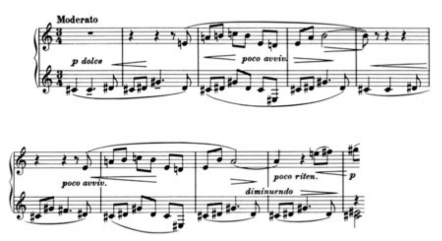
Example 6. A candidate for bitonal analysis: Mazurka op. 50, no. 3, mm. 1–10. Karol Szymanowski "Mazurkas | für Klavier | op. 50". © Copyright 1926 by Universal Edition A.G., Wien. www.universaledition.com