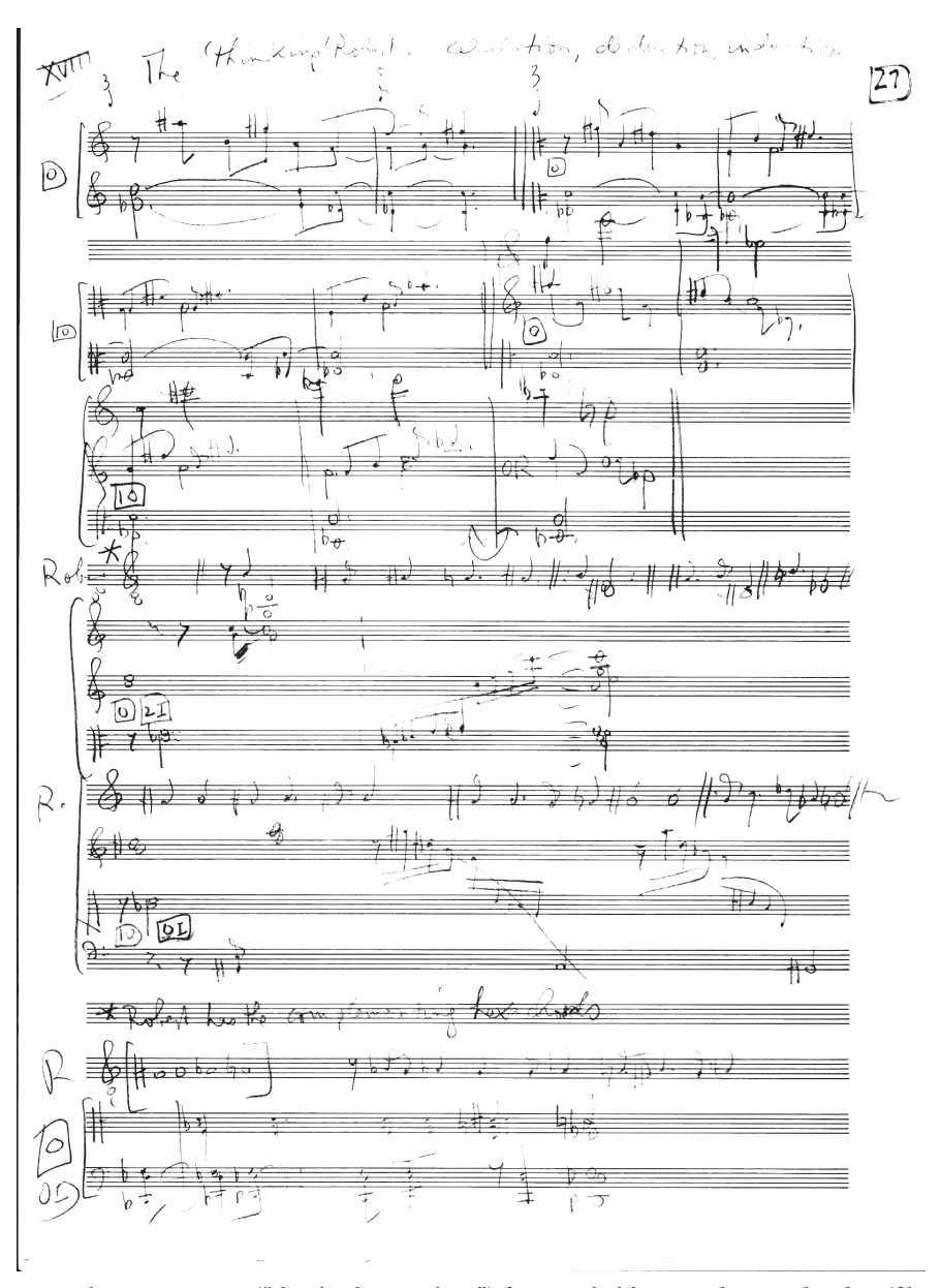
Example 1. Row XVIII ("the thinking Robert") from Anhalt's Oppenheimer sketches (file D1.91, box 60, MUS 164, Libraries and Archives Canada)