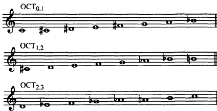
Example 1. Three transpositions of the octatonic collection

One challenge the analyst faces with works that utilize the octatonic collection is that it is rarely used in isolation but, rather, in conjunction with other harmonic