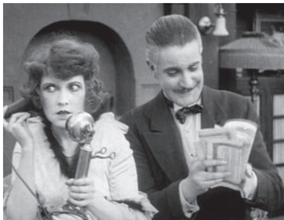
Figs. 6-8. Cecil B. DeMille, The Cheat , 1915.