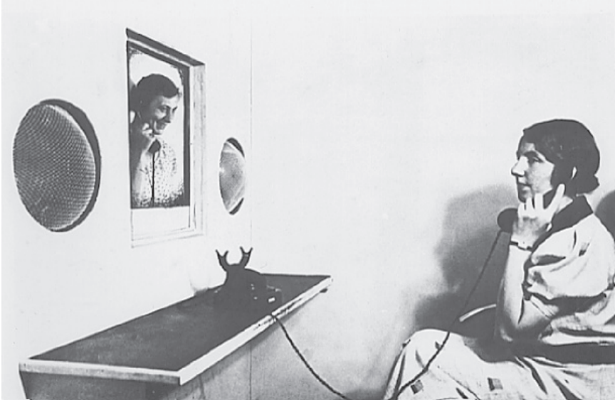
Fig. 4. Promotional photo for Germany's television-telephone service which connected post offices in major cities during much of the National Socialist era (ca. 1939).

rhythms and flow of daily life through a live feed would render the need for persuasive pre-produced programming content (the domain of the Propaganda ministry) redundant. In this case, control of the nation's neural networks, the ability to direct its gaze and forge a live connection between viewer and world viewed, provided the double advantage of superceding the impact of whatever propaganda program texts might be cast before the viewing public's eyes and perhaps even more importantly, served the project of electronically forging a Volkskoerper —a nation, a people, bound together by the synchronicity of experience. The responsible postal authorities were acutely aware of the added value of bridging the gap between subject and object, and the live televisual link promised to conjoin both in a manner that far superceded the capacities of storage-based media.