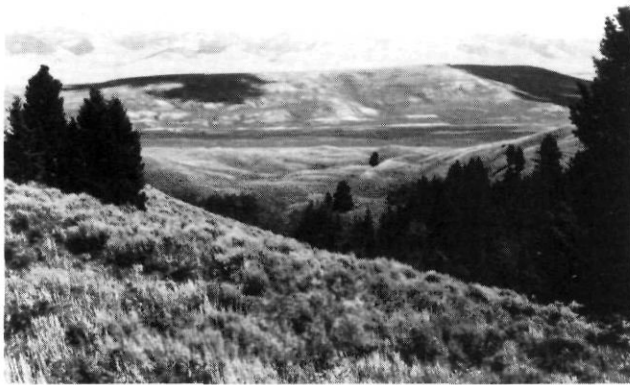
FIGURE 4. Typical Pinedale-equivalent terminal/recessional moraine complex, Deer Creek Canyon.

Complexe morainique frontal et de récession caractéristique d'épisodes corrélatifs au Pinedale, Deer Creek Canyon.