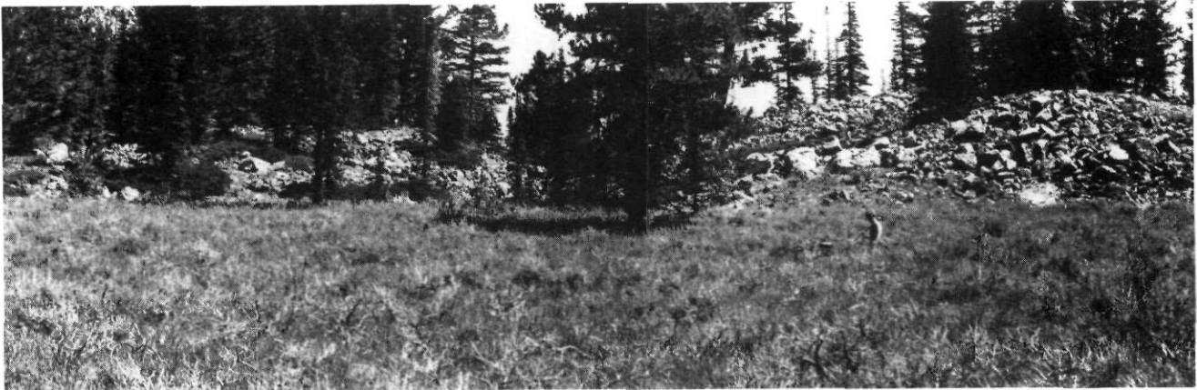
FIGURE 2. Middle Fork, Bruce Canyon Meadow. View is down-valley to the Pinedale-equivalent morainal dam. Person in soil pit provides scale.