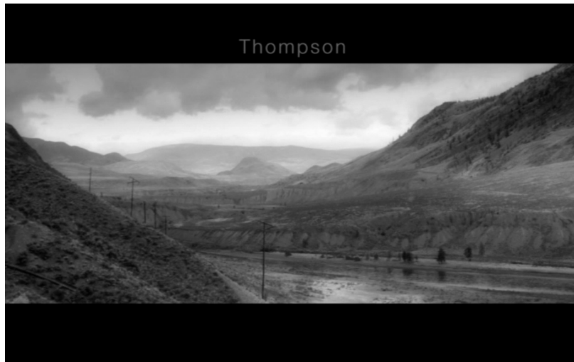
FIGURE 2 Christian Calon, Continental Divide , 2011, Thomson-Okanagan Plateau sequence.