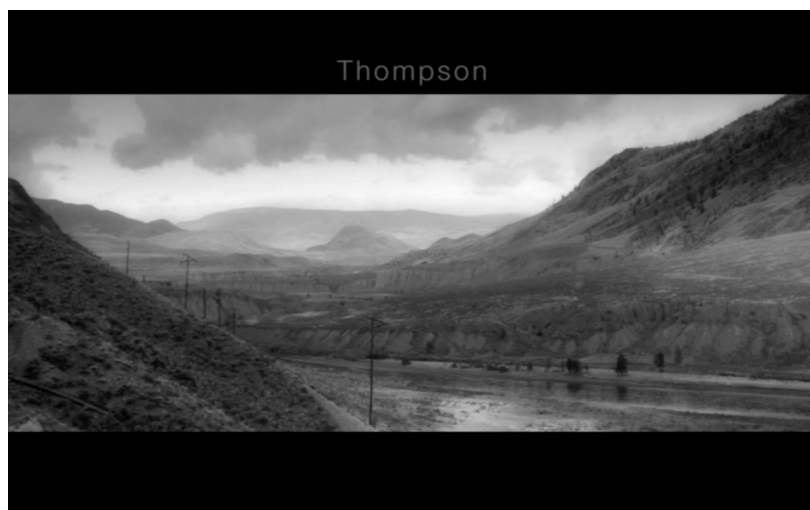
FIGURE 2 Christian Calon, Continental Divide , 2011, Thomson-Okanagan Plateau sequence.