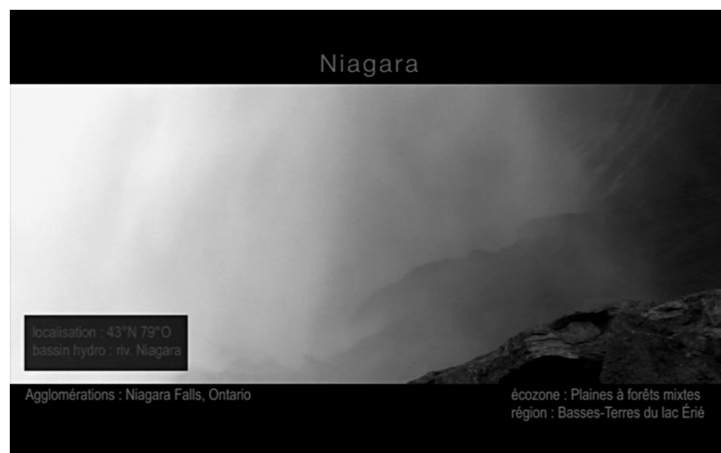
FIGURE 3 Chistian Calon, Continental Divide , 2011, Niagara Falls sequence.