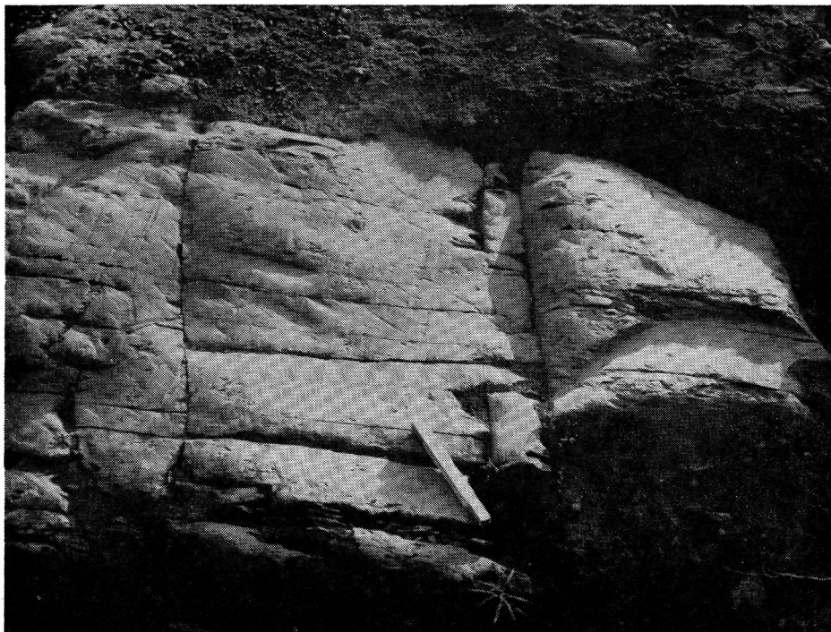
Two contrasting sets of striations at Maryjo Lake near Schefferville. The rule is aligned north-south.

ft.) in the southeast, and the Otish Mountains (3,700 ft.) ; there is no field evidence for flow of ice downslope from any of these areas (Ives, 1957 ; Wheeler, 1958 ; Løken, 1960). Concerning ice thickness, the area of greatest snow accumulation at the present day is along or just south of the Laurentian Scarp (Barry, 1959) and if this were so at the time of glaciation, then the ice might be expected to have been thickest and outflow greatest from this area just to the north of the St. Lawrence River (Bird, 1959). But again, there is no sign of outflow from here ; and if there were outflow from any of the areas mentioned at any