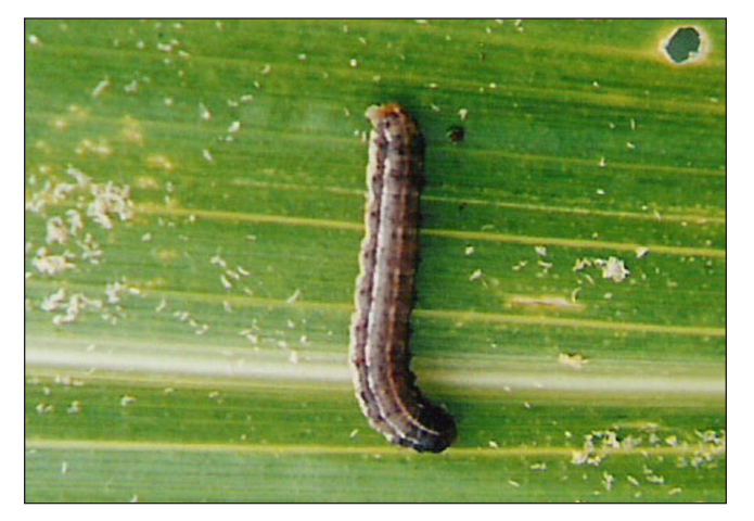
FIG. 1. Fall armyworm and damage caused on a corn leaf.

All Bt strains were tested against 2-day-old S. frugiperda