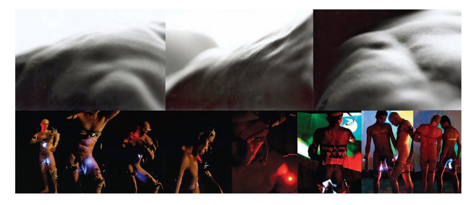
Jaime del Val, Antibodies of Surveillance and Control - Microdances, 2007-.

Intimare as that which is felt-seen in the moment where the limit, the limit of vision, the limit of the skin-envelope, briefly touches on the unlimited, the beyond-limit of the plane of immanence, and for that half-second, brings them into relation.