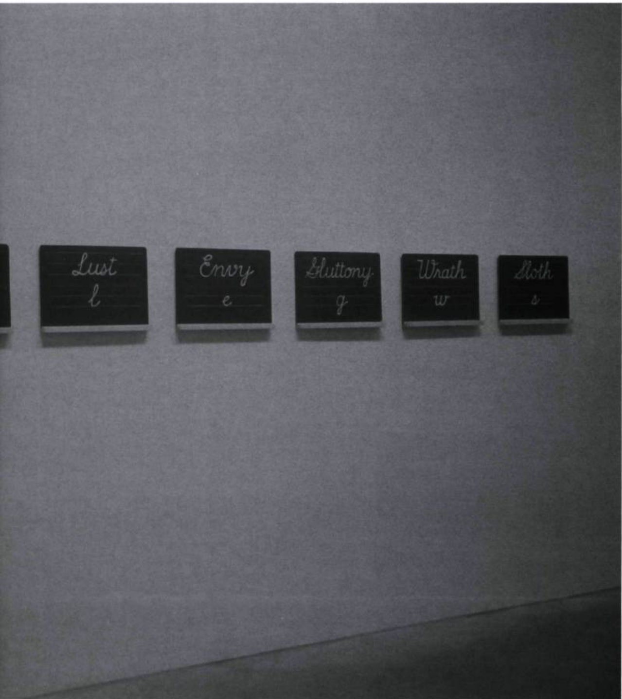
Ian Carr-Harris, Seven Deadly Sins , 1997. Craie et tableaux; chaque tableau: 31 x 42 cm. Courtesy Susan Hobbs Gallery. Photo: Isaac Applebaum.