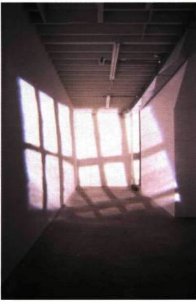
Ian Carr-Harris, 137 Tecumseth , 1994. (Projection # 1).