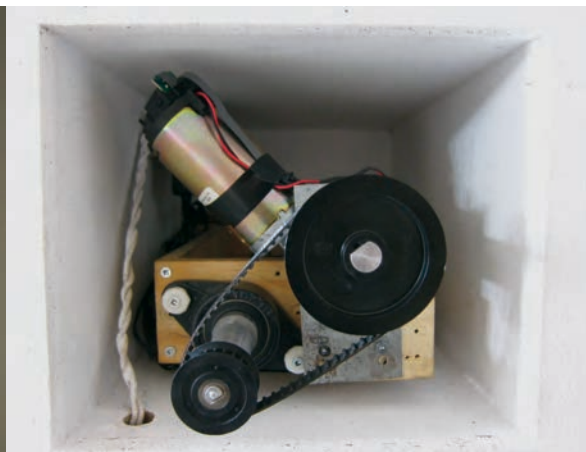
Ingrid BACHMANN, Pinocchio's Dilemma , 2007. Detail of the nose mechanism, cast resin, servo motors, arduino microcontrollers, metal, Plexiglas, plastic, wood, sensor.