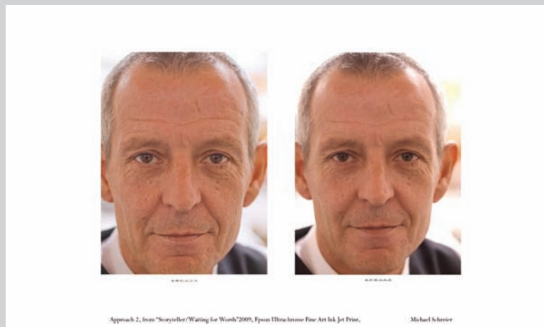
Approach 2, from "Storyteller/Waiting for Words" 2009, Epson Ultrachrome Fine Art Ink Jet Print, Michael Schreier

The Or-Sarua installation is composed of seven 83 x 44 cm vertical images, each edged with a black border, that hang like banners between two cylinders. The allusion to